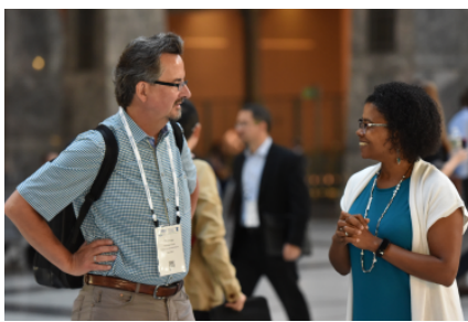
The Grand Hall at the Pennsylvania Convention Center (PCC) was a large, welcoming space for attendees to gather. It's placement between the PCC and the Marriott and Loews hotels also made both a gathering place and a thoroughfare for attendees.