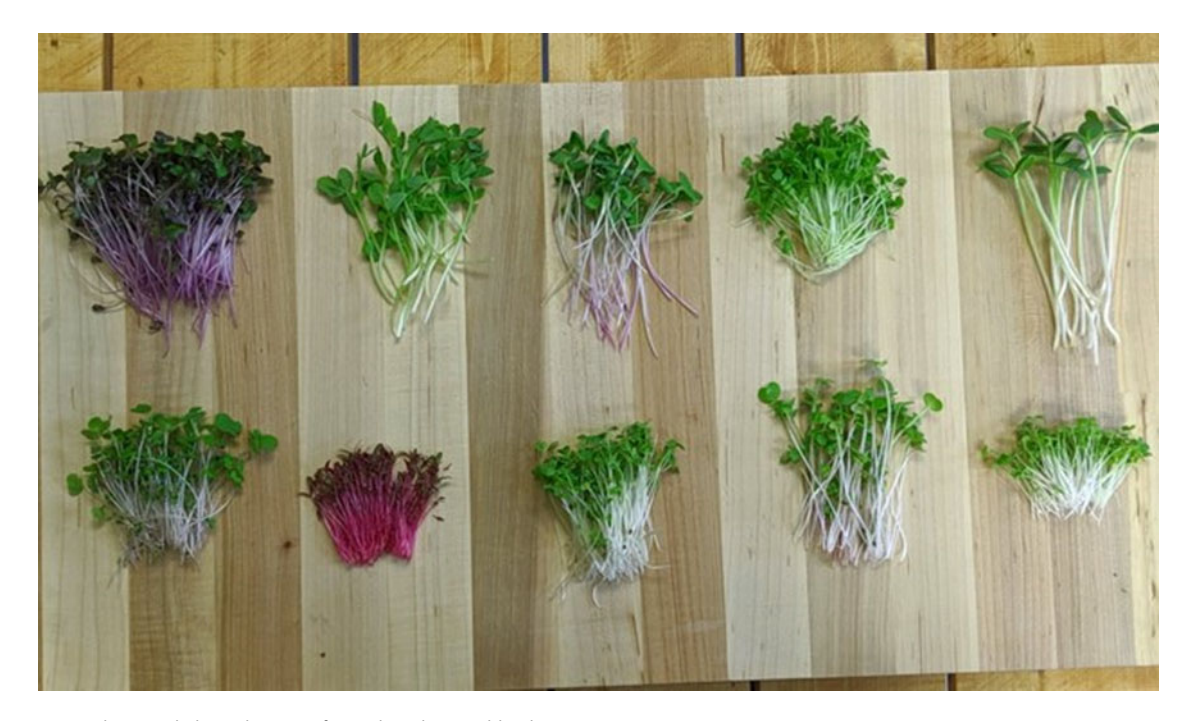
Fig. 2. Microgreens are harvested above the roots, few inches above soil level.

Although the nutrient levels found in some mature vegetables are less than the adult recommended daily allowance (RDA) [Table 1 (Choe et al. , 2018)], many studies have reported that