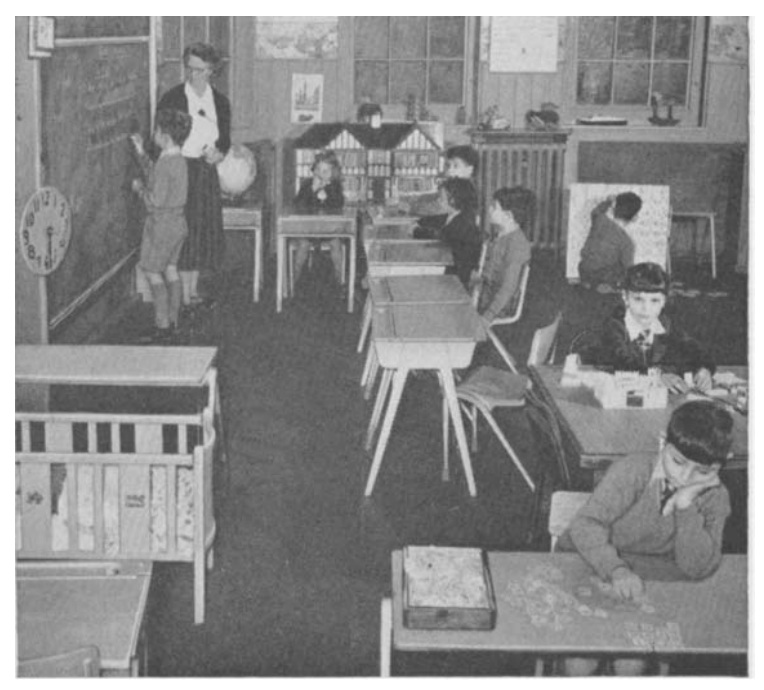
The Kindergarten Class at the London Residential School for Jewish Deaf Children where all classrooms have been installed with the Multitone Telesonic Induction Loop System