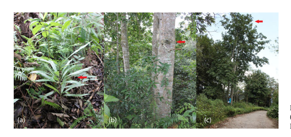
PLATE 1 (a) M. ovoidea seedling, and (b) and (c) adult M. ovoidea in Youfang Po (Fig. 1).

Oryx , 2020, 54(4), 466–469 © 2019 Fauna & Flora International doi:10.1017/S0030605318000704