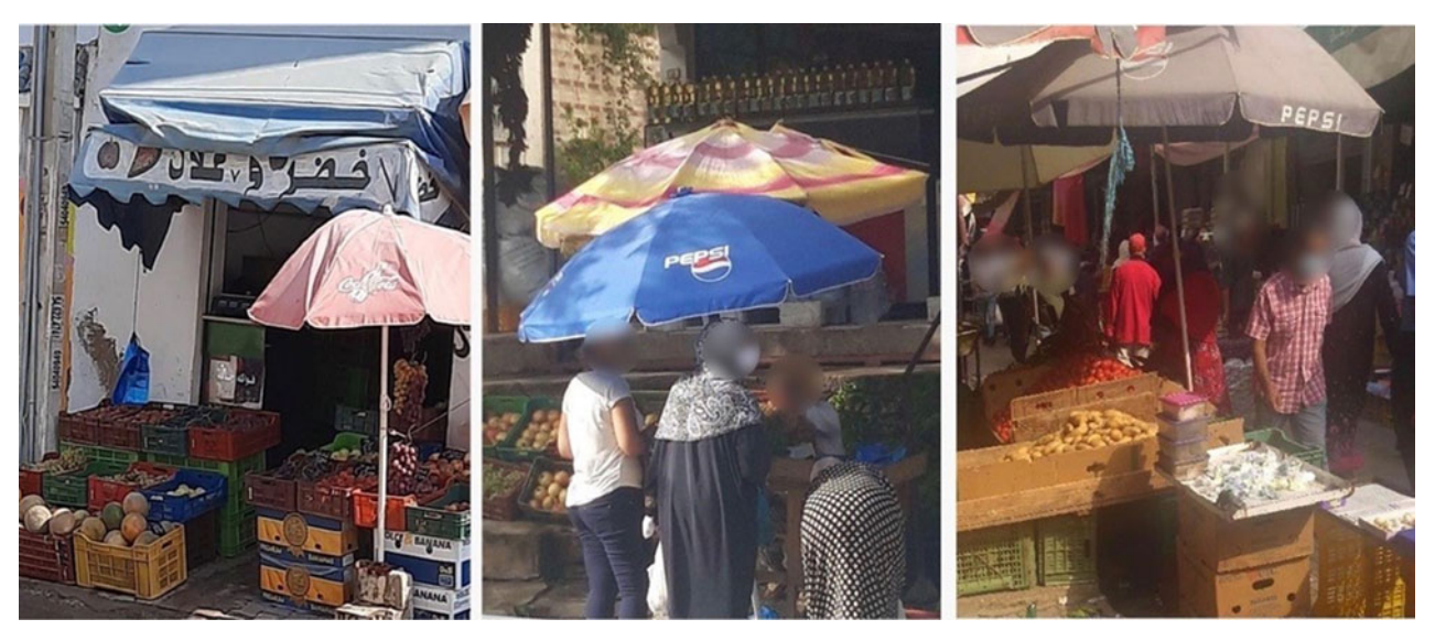
Fig. 2 Sample pictures of fruit and vegetable stores/markets with parasols promoting ultra-processed foods. Legend: Pictures were taken by data collectors whose names are mentioned in the Acknowledgements section. Permission to use their pictures was granted

As shown in Table 5, the 2098 food advertisement sets included 3622 different food groups as one food advertisement set might include several products. The prevailing food group promoted was carbonated beverages and sugar-sweetened beverages (22 %); this was followed by sweet snacks (9.4 % and 7.2 %). Around 11 % consisted of non-sweetened beverages and only 3 % of fresh fruits and vegetables.