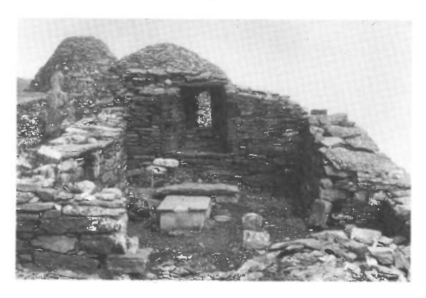
Fig. 3. St. Michael's Church on Skellig Michael, County Kerry

Skellig Michael, off Port Magee near Caherciveen, was founded supposedly by St. Finan. Historic records list a Viking raid in AD 823 and other funerary dates of AD 950 and 1044 (Harbison 1982). The monastery continued to be used into the Middle Ages, and is still the aim of pilgrimage today. Sample UCLA-2738D was collected from St. Michaels Church (Fig. 3) and dated to 1250 ± 25 BP. The later expansion of the original 8th century church permitted us to select a sample, UCLA-2722D, from a newer construction phase which dates to 975 ± 75 BP. Thus, Phase I of St. Michael's Church dates to the 8th century, and phase II to the 11/12th. Literature on Skellig Michael includes Horn, Marshall and Rourke (1990), Killanin, Duigan and Harbison (1989), Harbison (1982) and Lavelle (1976).