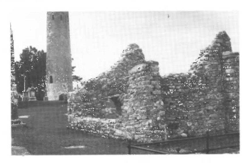
Fig. 4. Clonmacnoise: Temple ciaran in foreground and O'Rourke's Round Tower in the background to the left

548-549, is buried here. Also, an 11th century crozier was found in the oratory. In 1984, a mortar sample, UCLA-2727B, was dated to 1245 \pm 55 BP, one of the oldest oratories.