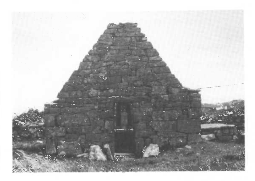
Fig. 2. Kilgobnet Church on Inishere, Aran Islands