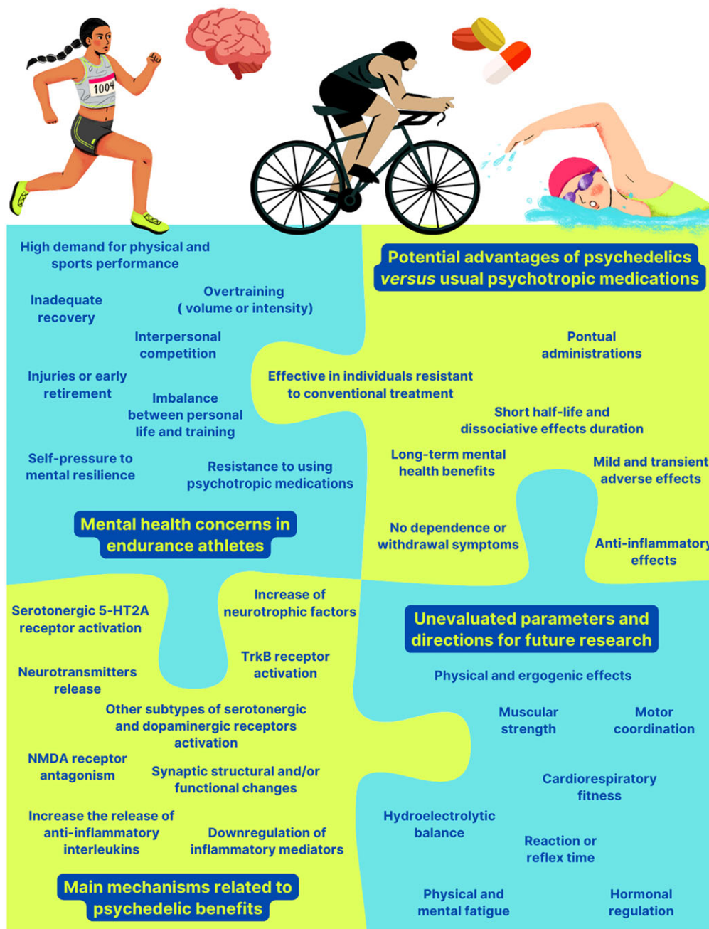
Figure 1. An overview of the current landscape of psychedelics and athletic performance.

in inflammatory markers in these clinical conditions and the significant role of inflammation in their pathophysiology (Bauer & Teixeira, 2019; Beurel et al. , 2020; Zeng et al. , 2024). Since research on the use of psychedelic substances in sports contexts is incipient (Fig. 1), far more studies are needed before potentially establishing guidelines on their safe and effective use.