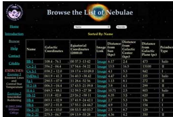
Figure 1. Browse page with master PN table showing all available objects, coordinates and distances. Note the radio button for re-ordering according to any table column.