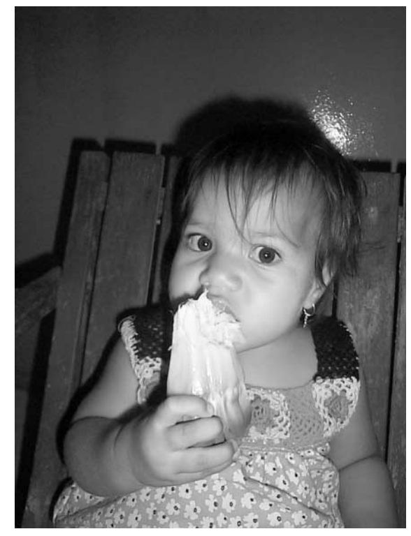
Fig. 2 Young child chewing and sucking on a pandanus key for its sweet \ensuremath{\mathsf{pulp}}

structured collection of pandanus samples, were used to more fully characterise the cultivars and samples collected.