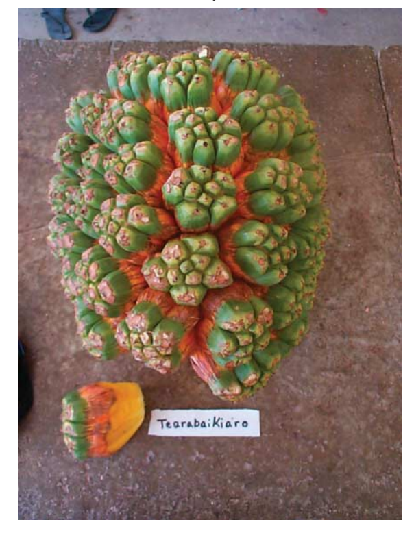
Fig. 1 A ripe pandanus bunch, Tearabaikiaro cultivar, and one key, showing the outer green inedible portion and the orange-yellow coloration of the edible portion

cultivars<sup>28–30</sup> show that the carotenoid content varies greatly among cultivars, with the greater carotenoid content found in those cultivars with the deepest coloration. The provitamin A carotenoids include \beta carotene (the carotenoid making the greatest contribution to vitamin A activity), \alpha -carotene and \beta -cryptoxanthin<sup>1</sup>. Epidemiological studies show that the consumption of foods rich in other carotenoids, such as lutein, zeaxanthin and lycopene, protects against certain chronic diseases such as heart disease, certain cancers, diabetes and agerelated macular degeneration<sup>31–34</sup>, indicating that consuming these carotenoid-rich foods may have multiple health benefits.