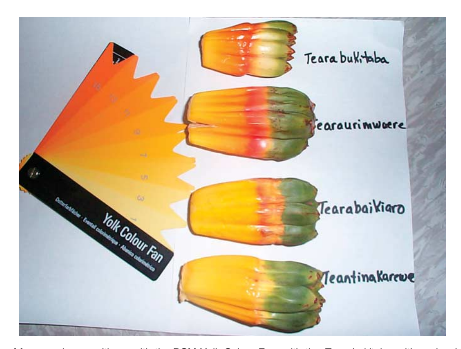
Fig. 4 Comparison of four pandanus cultivars with the DSM Yolk Colour Fan, with the Tearabukitaba cultivar showing with the greatest coloration

In general the deeper coloured pandanus cultivars and other foods with deeper coloured edible portions had