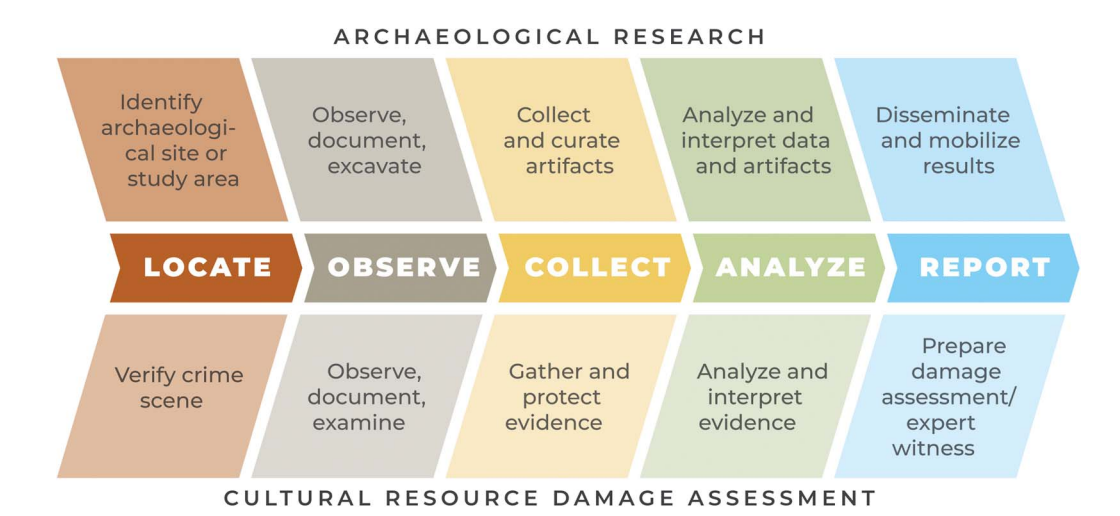
Figure 1. Procedural parallelism in archaeology and cultural resource damage assessment.

Archaeologists alone cannot halt unauthorized cultural resource alteration, but core elements of archaeological ethics (Table 2) prohibit professionals from ignoring alterations or associated harms to descendant communities and others. One such mandate, NHPA Section 110, requires federal agency preservation programs to identify, evaluate, nominate, and protect historic properties eligible for listing in the National Register in