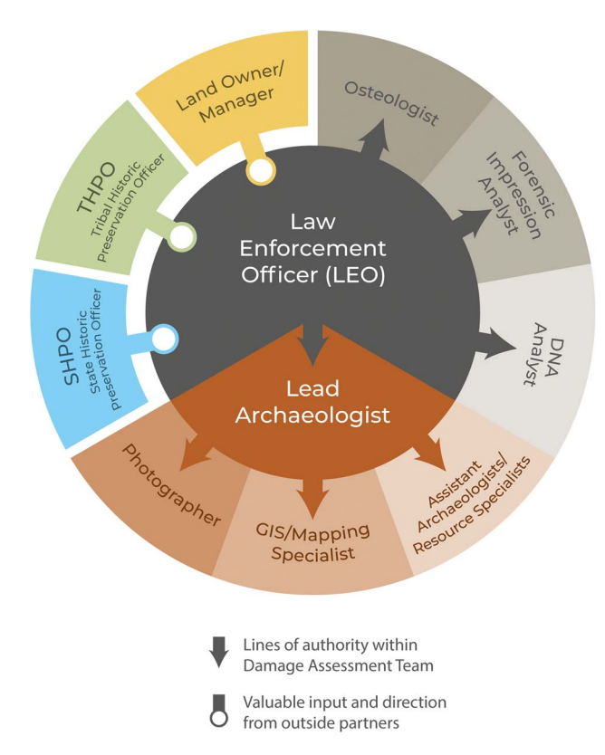
Figure 4. Idealized damage assessment team and lines of authority and input.

The LEO directs the CRDA and coordinates with local or tribal law enforcement. The lead archaeologist or another cultural resource professional typically guides consultations with historic preservation officers, landowner/managers, and nonlocal Indigenous