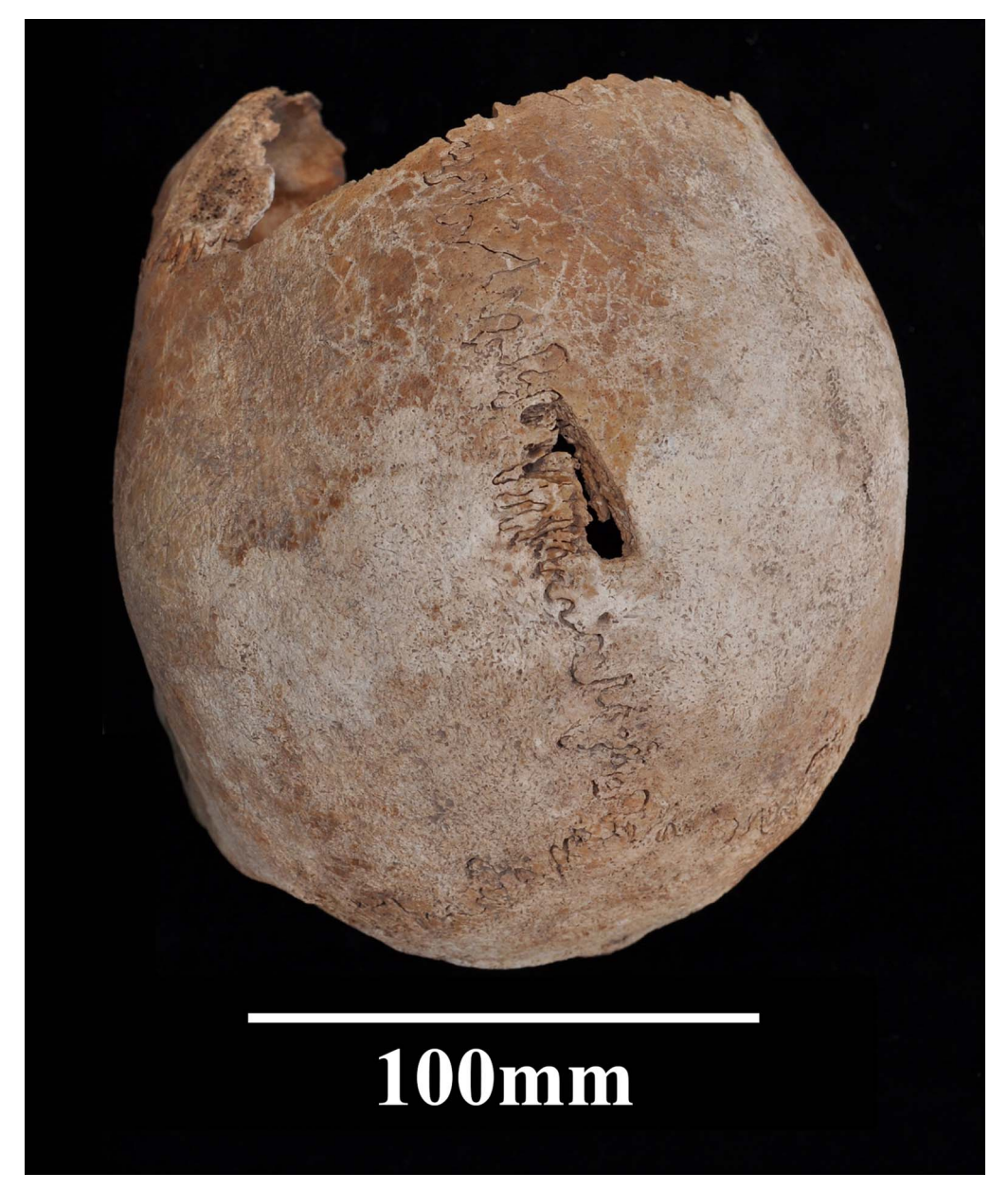
Figure 4. Peri-mortem trauma located on the cranium of an adult male individual from the Mogou site (M448 R3).