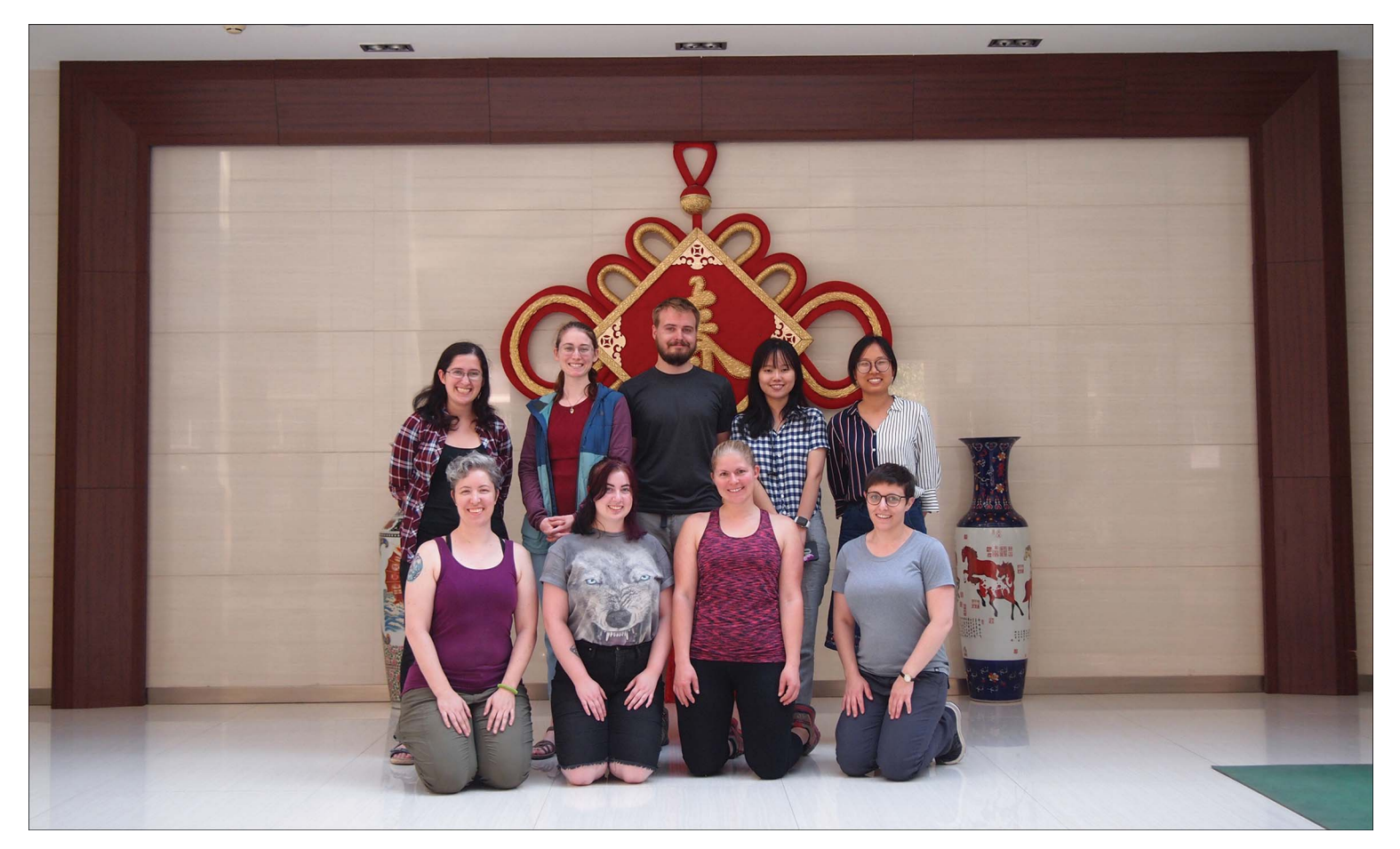
Figure 1. The 2019 field team of the Mogou Bioarchaeology Project at the Gansu Provincial Institute of Cultural Relics and Archaeology, Lanzhou, China.