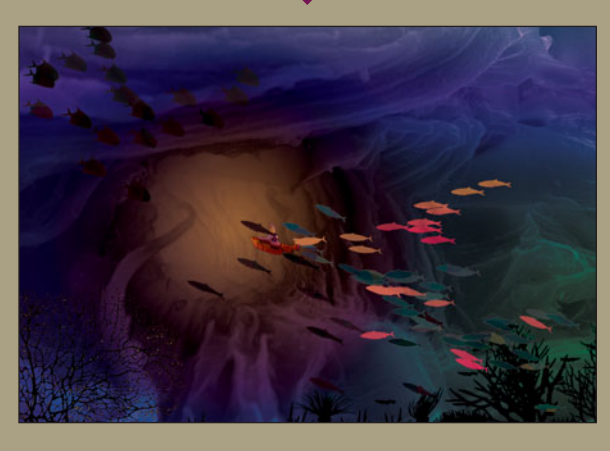
February 2015 answer key