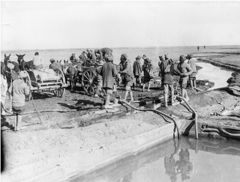
Figure 6.3 Indian army engaged in chlorinating water at an advanced post in Mesopotamia, 1917.

Priya Sathia has argued that, after the horrors of industrial combat on the Western Front, British war officials made the mission of ‘developing Iraq’ into a key site for the ‘redemption of empire and technology’, a point we briefly touched upon in Chapter 3. 34 As early as 1916, Edmund Candler had noted that a military infrastructure – the construction of roads, bridges, dams – was cast as a way of ‘bringing new life to Mesopotamia’ at a time when ‘the war had let loose destruction in Europe’. 35 The main agents in such technological rejuvenation of Mesopotamia were the British Indian army – its labourers, sappers, miners, engineers, signallers – as photographs portrayed them engaged in a wide variety of roles: building bridges and dams, chlorinating water at an advanced post (Figure 6.3), laying telephone cables, working at a slipway near the Shatt al-Arab waterway or fixing signalling posts, or driving a tractor to haul a howitzer across the Diala. While