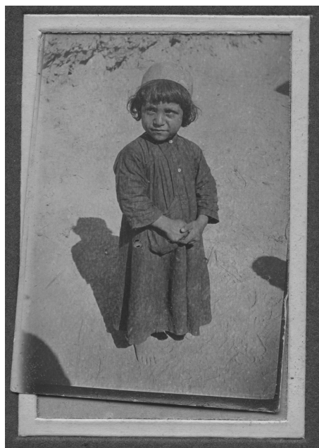
Figure 6.1 An Arab girl wearing a thwab and a tarboosh , photographed somewhere in Mesopotamia by Captain Dr Manindranath Das. Courtesy of Sunanda Das.

managed by the Government of India rather than the War Office in London, was a classic example of the colonial government's Macbeth-like 'vaulting ambition which o'erleaps itself/And falls on the other'. What began as a limited defensive operation in 1914 to protect the oilfields of Abadan and pre-empt any serious jihadi threat evolved in 1915 into a full-fledged offensive to capture Baghdad, and resulted in what is often considered the British Army's greatest humiliation in the First World War. In a campaign marked by dust, disease and death, the biggest debacle was the five-month-long siege in the city of Kut-al-Amara (7 December 1915–29 April 1916), and two years of abject degradation for the non-officer prisoners of war, both British and Indian, who would be dragged across Iraq, Greater Syria and Turkey. At the time of surrender, the number of Indians captured was around 10,440, including 204 officers, 6,988 rank and file and 3,248 camp followers. 5 While we have British POW first-person accounts, there have