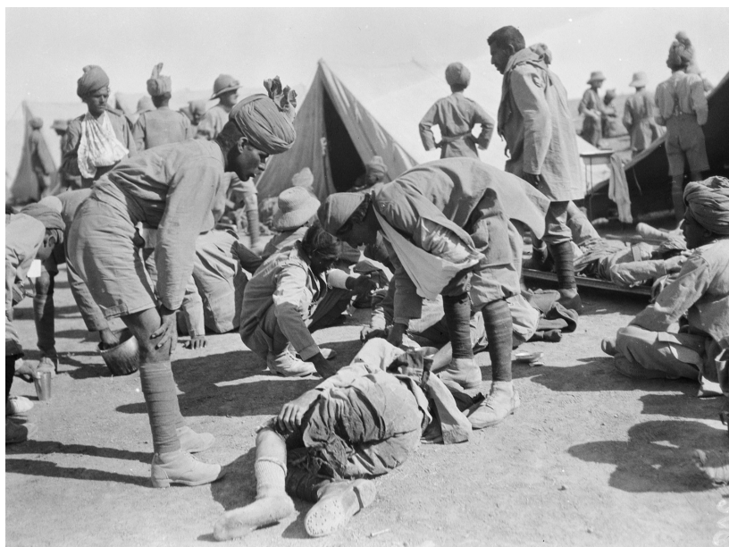
Figure 6.4 A Royal Army Medical Corps officer and some Indian staff tending to wounded Turks at an advanced dressing station after the action at Tikrit, November 1917. © Imperial War Museum (Q 24440).

does not mean that they did not do so. A number of images have recently surfaced which show officers from the Royal Army Medical Corps, along with Indian medical orderlies and stretcher-bearers, tending to wounded Turkish soldiers at an advanced dressing station in Tikrit in November 1917. One shows the Turks laid out in rows on stretchers, with the sun beating down, and Indian and British medical personnel at work; another shows a Turk sprawled on the ground, with two Indian medical orderlies poring over him (Figure 6.4). Though they were taken within the context of professional duty, these photographs, like the nursing memoirs by British women, suggest spaces of contingent contact between men across the political lines.