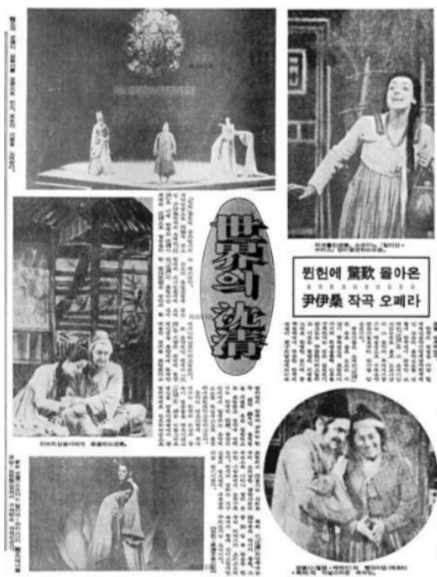
Figure 5: “Simch’öng in the World,” Kyöngnyang Sinmun , August 9, 1972.