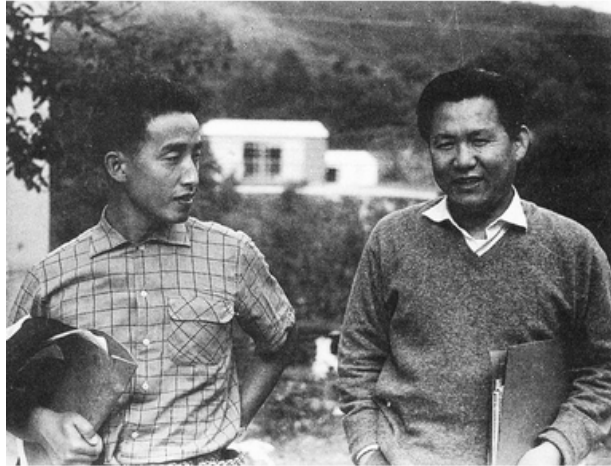
Figure 1: Paik Nam June (left) and Yun Isang in Darmstadt, 1958.

composer Ichiyanagi Toshi, and the Chinese American composer Chou Wen-Chung. 11