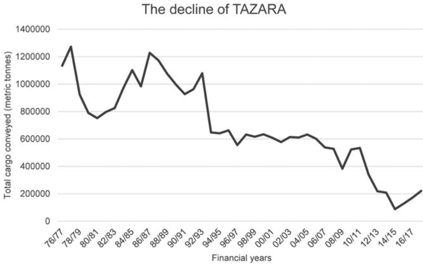
Figure 1 Cargo conveyed by TAZARA, 1976–2019

Tanzania and Zambia sought support from several Western governments, the Soviet Union, the World Bank, the African Development Bank (AfDB) and the mining multi-national Lonhro – without success. China first offered its support during Nyerere's China visit in 1965 (Gleave 1992; Lusinde Int.). A tripartite agreement was signed in Beijing in 1967, followed by surveys and planning regarding the route (Monson 2009: 24). Job Lusinde, the Tanzanian minister in charge of the transport and works portfolios between 1965 and 1975, remembered a conversation with Nyerere: 'From what Mwalimu [Nyerere] told me, Mao Zedong asked them [Nyerere and Kaunda] one question: "Would that [construction of a railway] assist the liberation of Africa?" And the answer was: "yes". And the reaction was: "It will be built". Just like that' (Lusinde Int.).