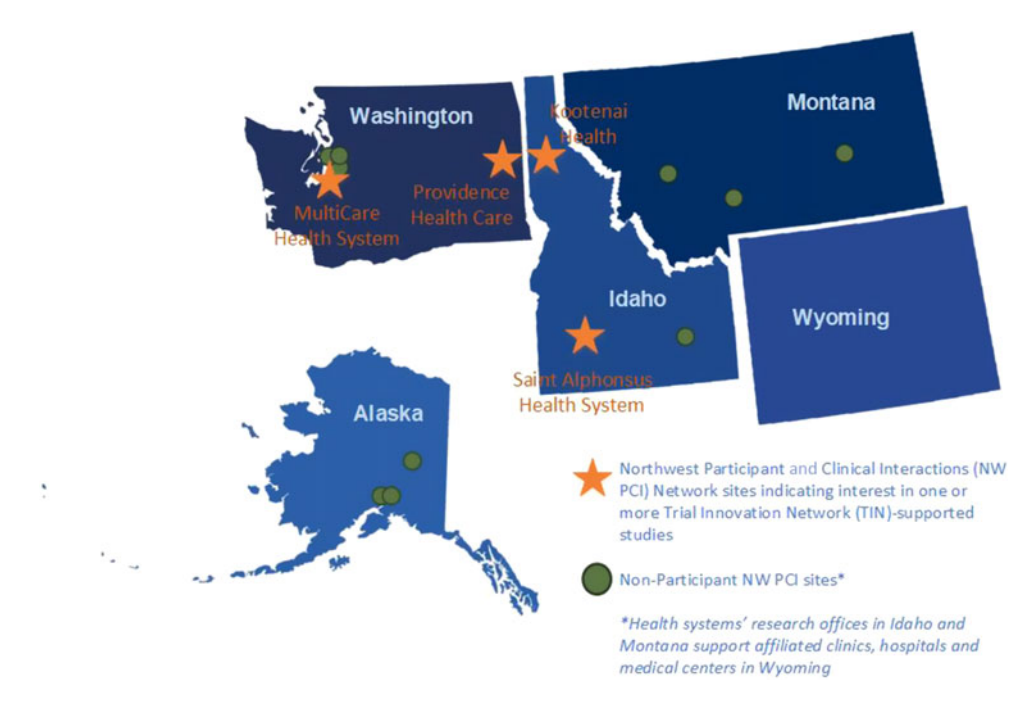
Fig. 2. Northwest Participant and Clinical Interactions (NW PCI)/Trial Innovation Network (TIN) participants and non-participant sites.