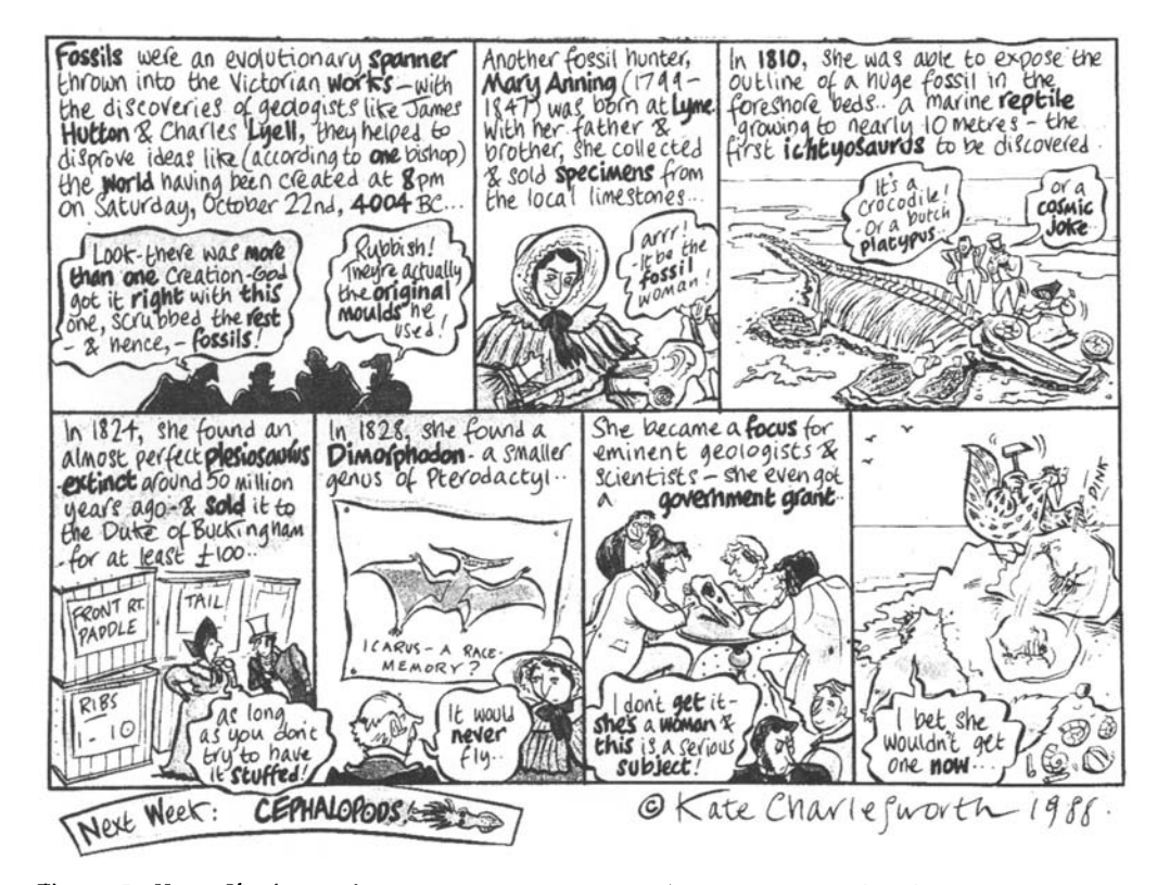
Figure 5. Kate Charlesworth, New Scientist, 3 December 1988. Reproduced with the artist's permission.

specifically condemned the 'deliberate dilution of expert knowledge in the output of almost all public media' in Britain!<sup>166</sup>