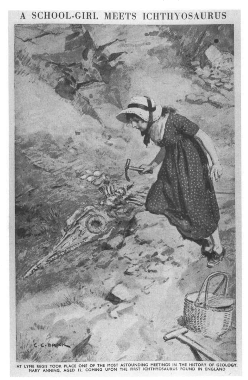
Figure 4. 'A school-girl meets Ichthyosaurus' by Charles Edmund Brock. From Arthur Mee's Children's Encyclopaedia, London, 1925.