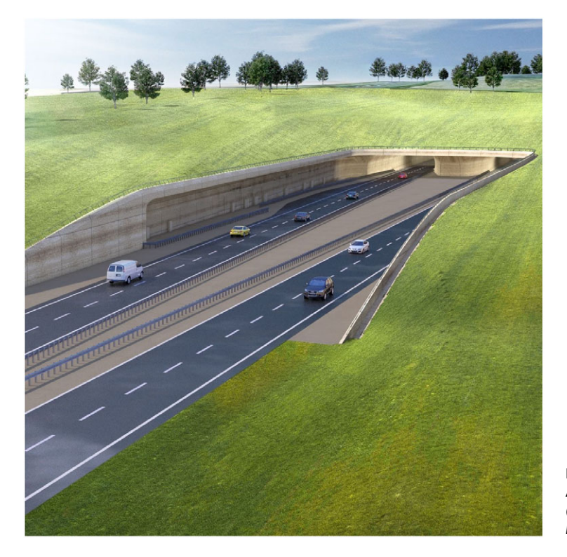
Figure 3. Plans for the A303 near Stonehenge (courtesy of Somerset Live via Google Images).