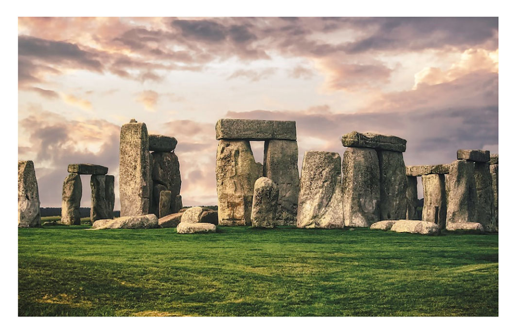
Figure I. Stonehenge.

Thus, as in Liverpool, the WHS is a significant heritage asset for national and international tourism, with Stonehenge attracting over a million visitors each year.<sup>74</sup> Given this, Stonehenge is one of the country's "most visited destinations or 'icons'."<sup>75</sup> Additionally,