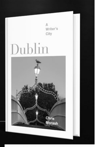
Save 20% with code DUB20