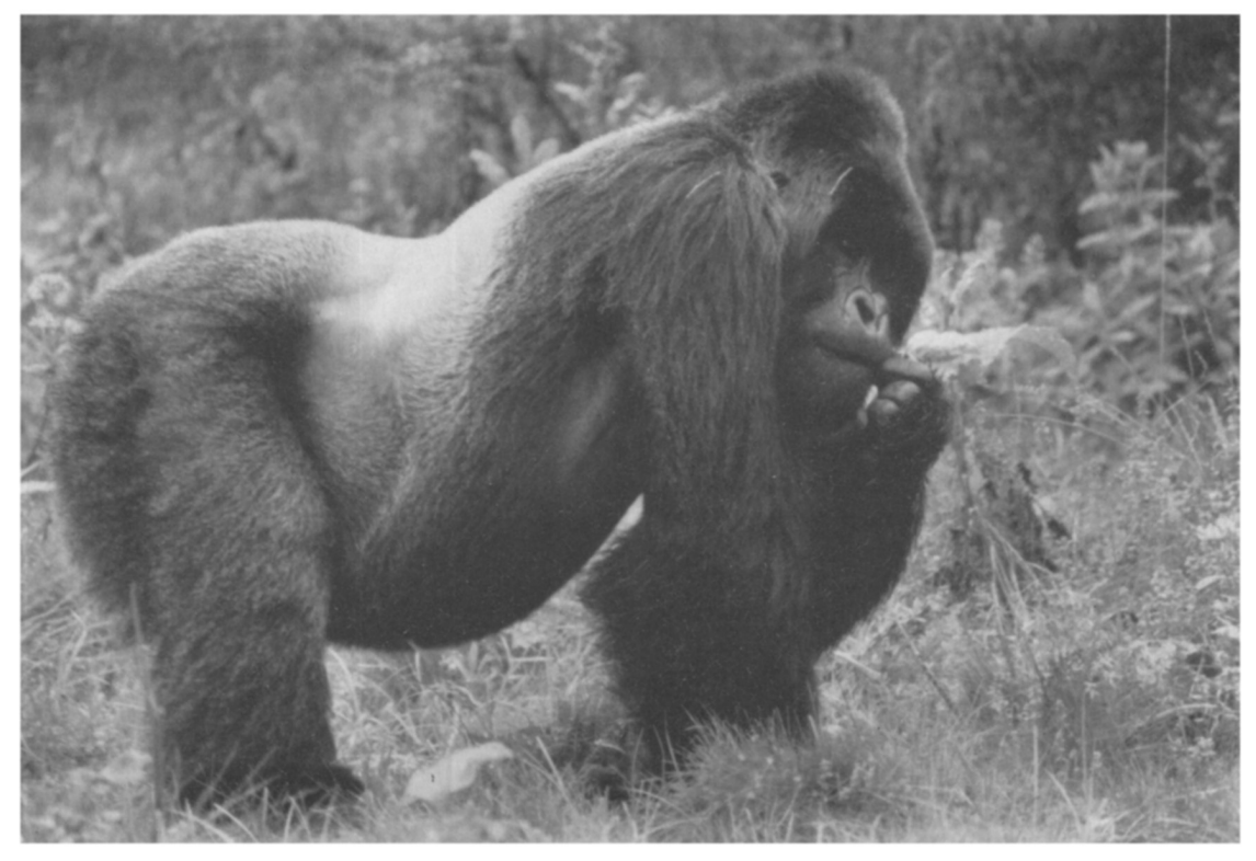
A male silverback gorilla in Rwanda.

University of California, Davis Primate Center, the Southwest Foundation for Medical Research, the Pullman Washington Regional Primate Center, and the Zoological Society of London. Analysis results revealed a high likelihood of measles in one expired animal. Causes of death in other animals included kidney disease, pneumonia, and vegetative endocarditis. At least one of the deaths occurred in a gorilla group not experiencing the respiratory outbreak.