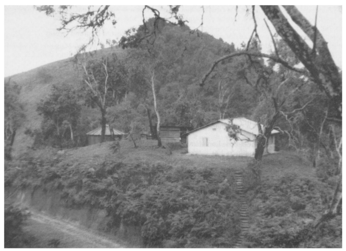
This game guard camp in the Impenetrable Forest, Uganda, was built using FFPS funds in 1988. Money donated by FFPS supporters of the project in 1988 was also used to buy 12 heavy-duty four-man tents, 15 sleeping bags and 20 heavy-duty rucksacks for game guards in Rwanda's Parc National des Volcans (Tom Butynski).