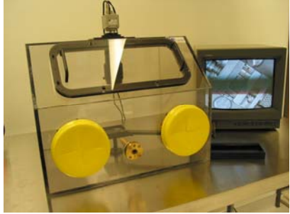
Fig. 2. The custom inert gas Glove Box with video camera and video monitor