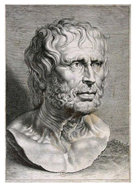
Figure 2. Lucius Annaeus Seneca

But it is the Letters of an ancient Stoic Roman writer, Lucius Annaeus Seneca, I think, which serve as the best example of a kind of ancient distance-learning program to illustrate my argument.