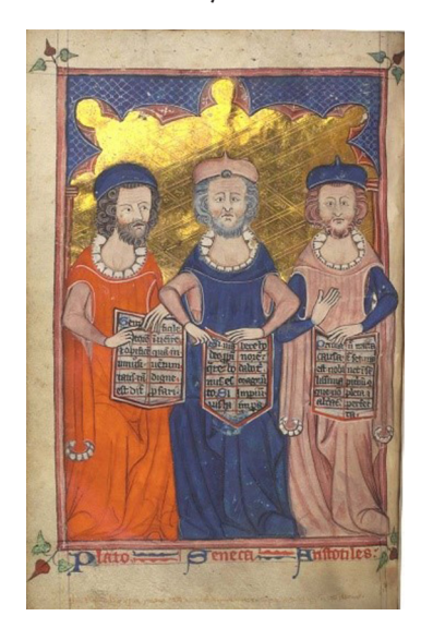
Figure 1. A Medieval image of Plato, Aristotle and Seneca

On April 6<sup>th</sup> 2020 Steven Hunt wrote in Ad Familiares about the relative preparedness of Classics for distance-learning in a time of coronavirus (Hunt 2020). He wrote, 'Classics continues to thrive online, buzzing up and down the wires, zapping through the air, and into countless homes through computer screen, laptop, ipad and smartphone.' (Hunt 2020). Pointing to over two decades of intentional investment in an online, digital world for Classics and Classics learning in the UK and US, Hunt concludes: 'So now, with the challenges before us of having to teach remotely using the internet, Latinists are already digital natives: students know how to find the materials, use them efficiently, and learn.'