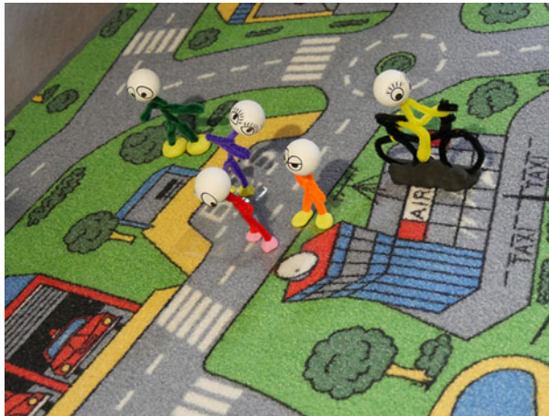
Figure 3. Miniature scenario enabling a shift in perspective through a 'helicopter view' of the traffic situation.

obstacles by the car is projected onto the vehicle's windscreen. The windscreen acts in a manner similar to a mirror, and road users can ascertain whether the car has noticed them or not depending on whether their reflection is visible in the mirror. The foundation upon which this concept was envisioned was the idea to externally represent the car's situational awareness by mirroring its knowledge, and thereby instilling a sense of safety to the surrounding road users.