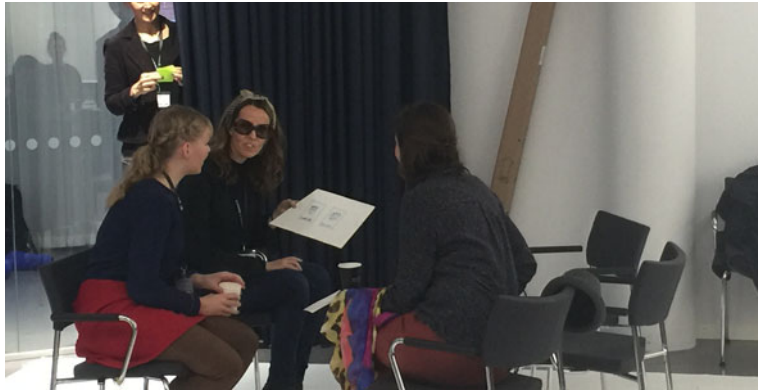
Figure 4. The chauffeur mode on the way to a night out. The vehicle interaction was mediated by the voice assistant hiding behind the curtain.