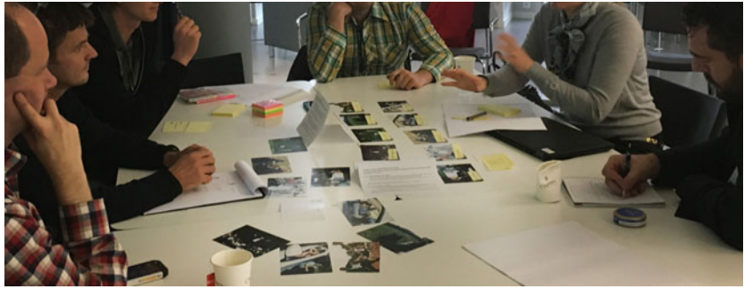
Figure 5. Participants discussing with the help of the cards and guided by discussion questions placed in the middle of the table.

Figure 5, the cards were used, sorted and annotated during the discussion and served as a record of which options had been eliminated, but they were not used to create a new interaction.