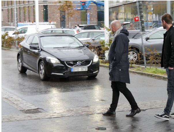
Figure 2. Workshop participants interact with a seemingly driverless and autonomous WOz-vehicle.