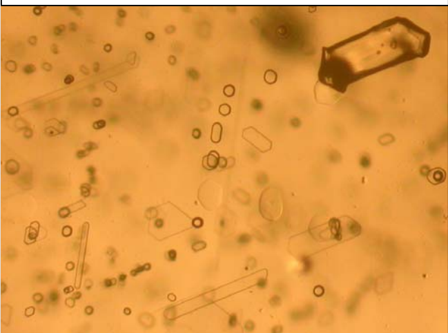
Figure 2. Optical micrograph of the same ice taken using a digital camera on a bench microscope, showing small spherical bubbles and one large and many small flat polygonal voids. Magnification 65X.

Figure 1. Section of polycrystalline Vostok (Antarctica) ice core from 3399 m. Reflective areas inside are groups of hexagonal plate shaped voids lying on the basal plane of a crystal. The line across the left corner that appears to be a crack is shown in more detail in Fig 3b, c, and d.