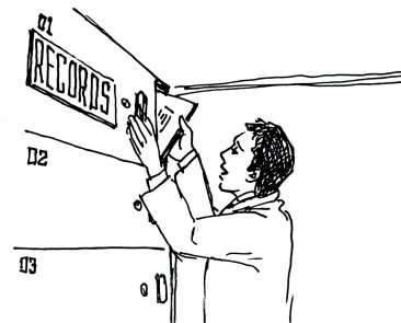
Always store patient clinical notes in a secure location.