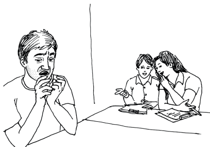
Do not gossip about patients.

As with all health care, any information given by the person to the health worker should be kept confidential. The sensitive nature of mental health problems and the risk of discrimination against the person make this especially important for mental health care. Never discuss a person's story with anyone who is not a colleague and, even in this case, only do so if it is relevant to the care of the person. Explain that what the person tells you will be kept confidential and will only be shared with your colleagues if you wanted to consult them for advice. An example of when breaking confidentiality could be necessary would be the rare situation when the person tells you that they are planning to kill themselves and refuses all care, or if the person expresses a clear threat to harm a specific person.