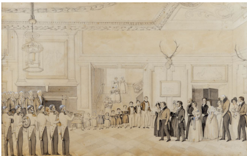
Figure 1. Military bandmen, probably from the Glamorgan Militia, perform at a dance in the New Hall of Tredegar House in Newport, Wales, c. 1830. Artist unknown.

soldiers by hiring themselves out to ‘mountibanks, puppet show-men and such like’ at fairs around Dublin. 65 Recalling his youth in Richmond, North Yorkshire, in the 1820s and 1830s, Matthew Bell described the expert militia band as a ‘very popular’ source of free entertainment for poorer townspeople and claimed it aroused ‘a slumbering talent for music in some of those who heard its martial and inspiring strains’. 66 The continued audibility of militia musicians also had political implications: their performances encouraged crowd participation in local royal ceremonial and lent an appealing aura to the established order, though bands in Ireland could also spark indignation among Catholic listeners by playing tunes with sectarian connotations. 67