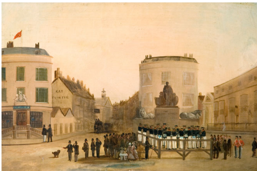
Figure 3. 'Band in front of the King's Statue, Weymouth, Dorset', by A. Beattie, 1844. Weymouth Museum.