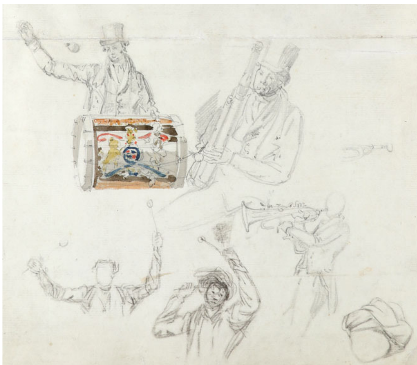
Figure 2. A study of musicians featuring a keyed bugle and a bass drum sporting the Royal Arms, c. 1815–40, circle of William Henry Pyne.