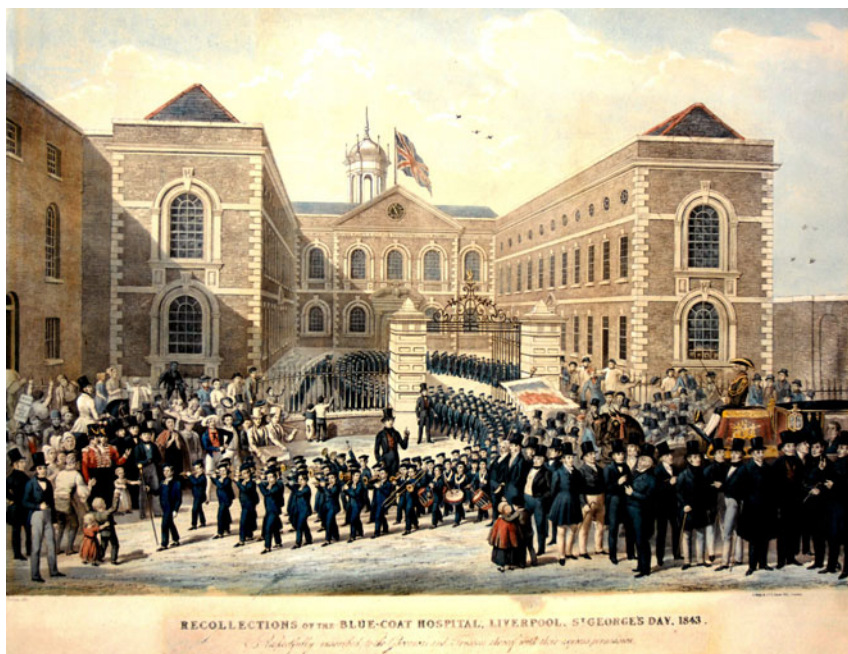
Figure 4. 'Recollections of the Blue-Coat Hospital, Liverpool, St George's Day, 1843', lithograph by Thomas Picken after Henry Travis, 1850.

for use 'on all public occasions'. 111 Other community bands receiving patronage from propertied townsmen played publicly on summer evenings in the manner of regimental musicians in garrison towns. 112 Enthusiasm for civic bands was particularly apparent in English seaside and spa resorts, which had benefited from the inaccessibility of continental alternatives in war-time. 113 Having grown accustomed to military ensembles playing for visitors on the promenade, Hastings formed a new town band to perform in the same spot from 1818. 114 Another town band in Southampton, led by a former militia bugle-major, played three evenings weekly on the Royal Pier in July 1834. 115 Quasi-military ensembles became equally indispensable leisure amenities in spa communities. Conscious of the need to compete against