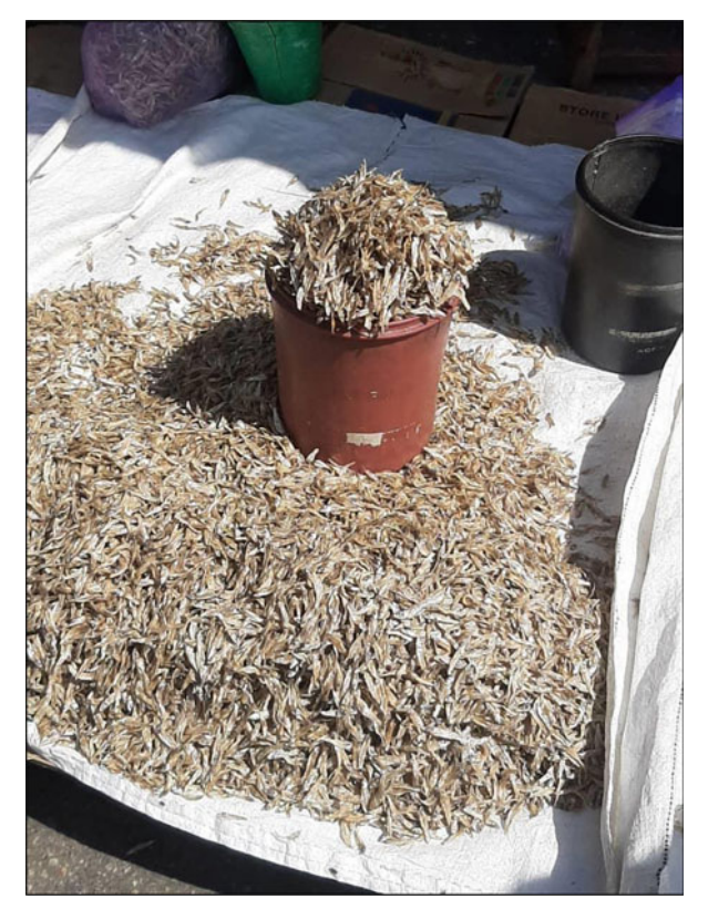
Fig. 1 Smallscale vendor's display of whole dried Kapenta at an open market in Lusaka, Zambia.

The study was conducted in the town of Siavonga, which is ~195 km from the capital city of Lusaka and abuts the vast artificial water body of Lake Kariba (see Fig. 2). Caregivers were recruited from fishing villages in Gwembe, Siavonga and Sinazongwe Districts in Zambia's Southern Province. The caregiver–child pairs convened in Siavonga and all caregivers were provided with childcare products (e.g. diapers, sanitary wipes and hand sanitiser) and