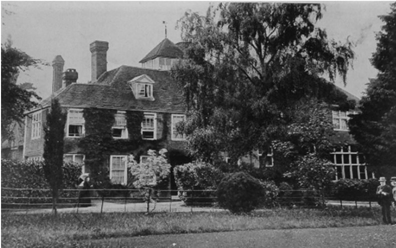
Figure 1.1 Top left, John Callcott Horsley, father of Victor, was a painter, Royal Academician, and designer of the first commercial Christmas card. Top right, Victor Horsley, aged 11. (From Paget S: Sir Victor Horsley: A Study of His Life and Work. Constable: London, 1919.) Bottom, the Horsley family home in Willesley, near Cranbrook, Kent.

Victor was a free-spirited, good-looking little boy, rather reckless and clumsy in his way, impetuous and often up to mischief. He spent much of his time playing at soldiers or games such as hide-and-seek; riding horses or ponies; playing tennis or skittles; collecting wild birds' eggs and nests; roaming the countryside while avoiding the gamekeepers; and getting into fights. As he got older, he also loved target practice with a pistol, walking for miles in