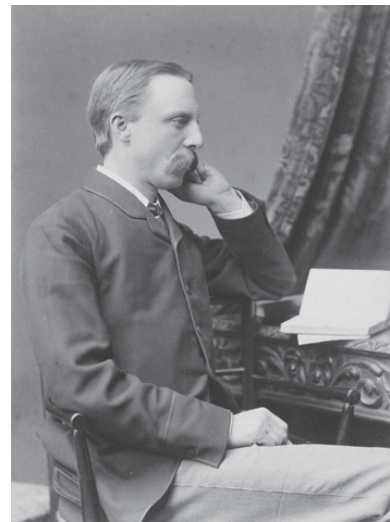
Figure 1.2 Left, Photograph of University College London, Gower Street, in 1871. Top right, John Burdon Sanderson, Jodrell professor of physiology at the college and first superintendent of the Brown Institution. Bottom right, Edward Schäfer (later Sharpey-Schafer), who succeeded Sanderson in the Jodrell chair and became a pioneer of hormone research. Horsley studied physiology under both men and later collaborated with Schäfer in studies of cerebral (cortical) function.

for the second, on the microscopic structure of intervertebral discs. 17 He shared the second-prize silver medal in physiology with Francis Gotch (his future brother-in-law) in 1877, and won the silver also for practical physiology in that same year. At the time “the traditional views of physiology were essentially anatomical in character, and one of the most impressive features of Burdon Sanderson’s lectures was the vivid interest of his teaching that physiology was the