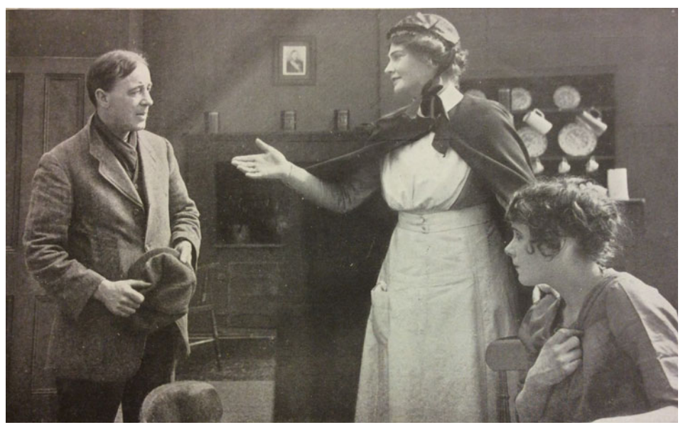
Figure 3: 'Scene from 'Motherhood' film: THE HEALTH VISITOR [Irving] APPEARS ON THE SCENE: Published by kind permission of the Transatlantic Film Company': Report of the National Baby Week Council (London: National Baby Week Council, 1917), 29, SA/HVA/F.3/3. Wellcome Library, London, after page 20.