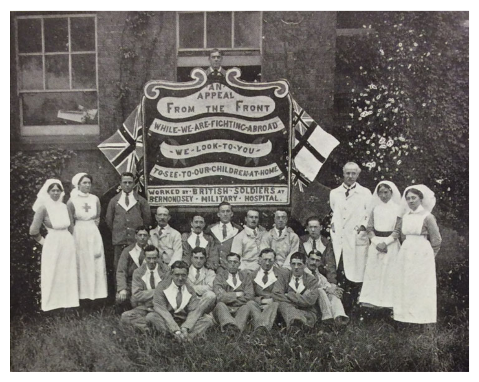
Figure 1: Banner made by soldiers at the Bermondsey Military Hospital and exhibited at the Central Hall, Westminster, during the 1917 National Baby Week: Report of the National Baby Week Council (London: National Baby Week Council, 1917), 29, SA/HVA/F.3/3. Wellcome Library, London, after page 34.

with the duty of mothering foisted upon them. Women of all classes found common ground as they participated in this event, just as infant-welfare historian Richard Meckel observed in America. <sup>56</sup>