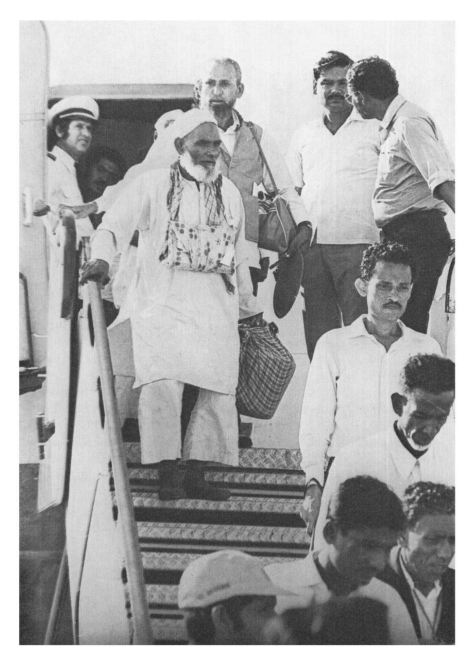
Arrival in Dacca of first group of Bengalis repatriated from Pakistan under ICRC auspices.