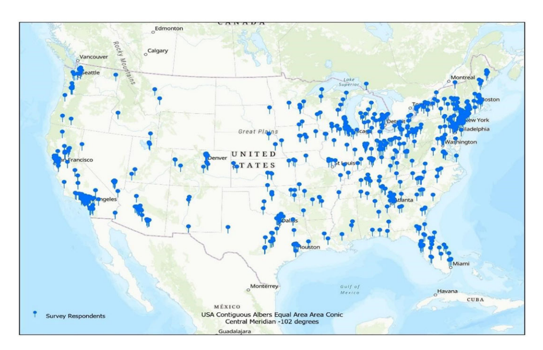
Figure 2. Geographic distribution of survey respondents (n = 804).

statistical relationships between regions and personal shopping behaviors. The respondents answered that they go grocery shopping once a week or once every few weeks. In addition, local supermarkets were the most popular source for typical groceries, whereas local supermarkets and farmers' markets were similarly popular for locally grown food sources. Around 70% of total respondents answered that they have different preferred sources for purchasing locally grown food from their typical grocery source; most of them stated that their most frequent source for locally grown food was farmers' markets. The frequency of choice for CSAs, by contrast, is the least frequently reported source for the locally grown food market, which confirms that the popularity of CSAs is lagging behind other sources (USDA NASS, 2014, 2016, 2022). Overall, while there were no regional characteristics in terms of shopping behaviors, the survey results showed that local supermarkets were the most preferred sources for both typical groceries and locally grown food, but farmers' markets were the most popular alternative source for locally grown food.