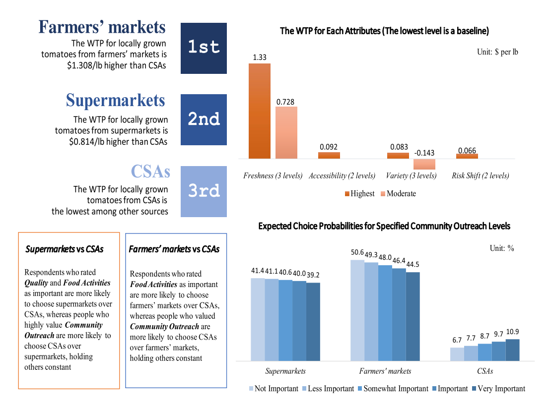
Figure 3. Summary of key findings.

were more likely to choose local supermarkets over CSAs, and those who valued Food Activities were more likely to choose farmers' markets over CSAs.