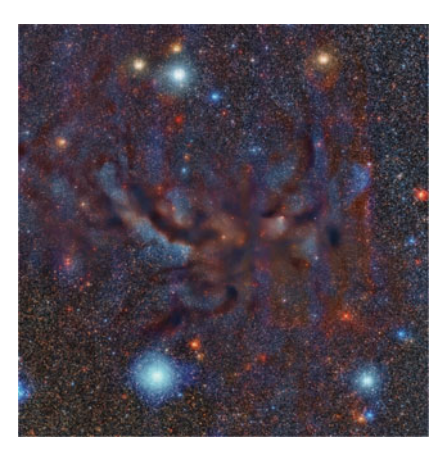
Figure 4. Optical Image of B 59, the most massive dense core in the Pipe Nebula. With 12 YSOs buried in this core, it is the most active site of star formation in the Pipe Nebula and an excellent candidate for producing a future moving group of young stars in the vicinity of the sun.