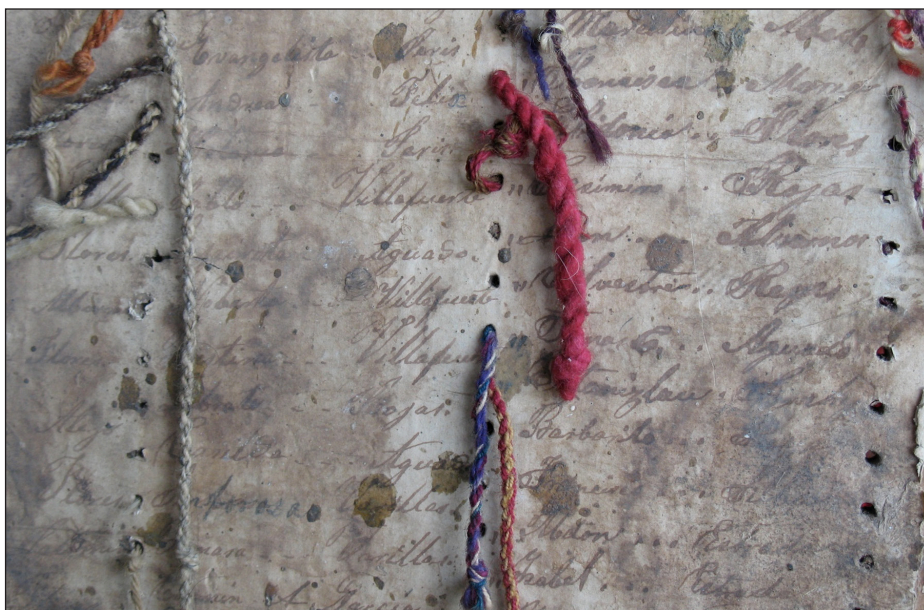
Figure 3: Cords of different thickness and texture, Mangas khipu board. The thinnest threads (e.g., the purple, blue, and white cord) are soft, while the thickest (e.g., the pink cord) are rough.

the padrones were also referred to as entablos in the Peruvian pastoral visitation reports from the Huacho diocese.