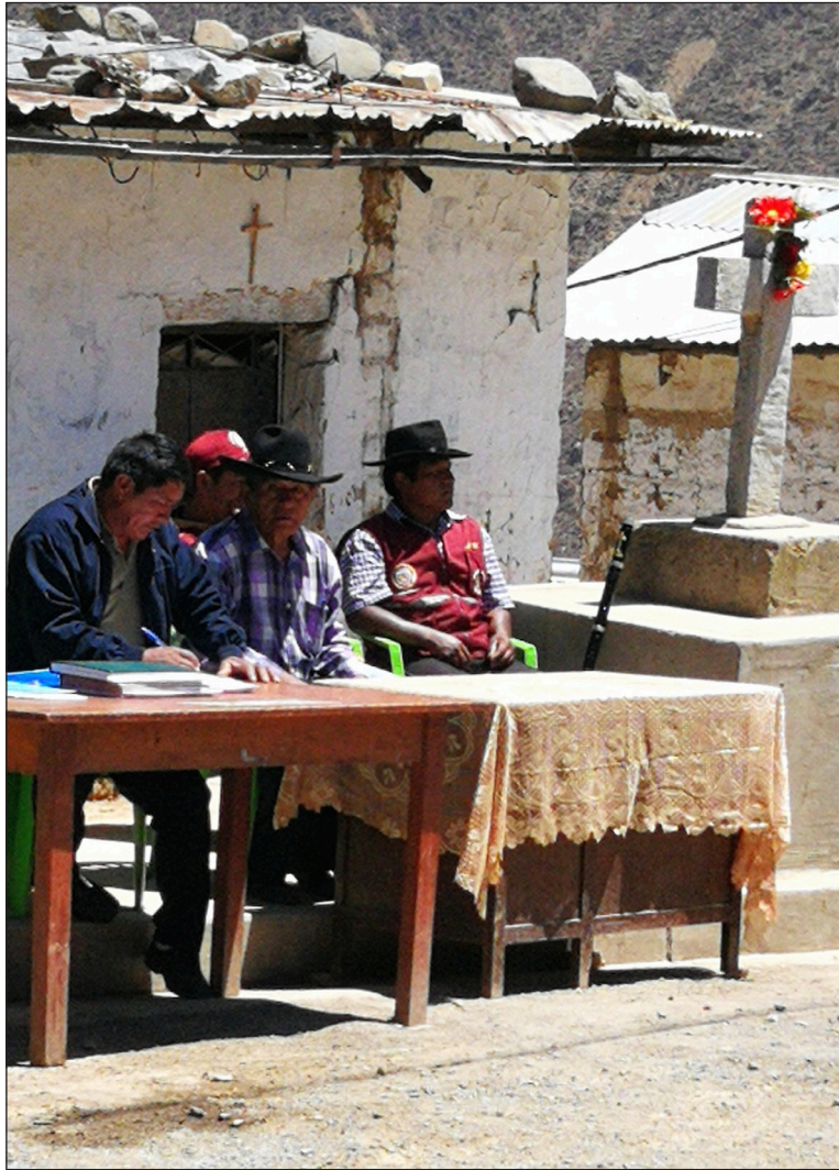
Figure 7: Stone cross in the Cuhuay plaza with tables set up for the reckoning of accounts. The khipu board used to be set up next to the cross.

flowing (Jennings and Bowser 2009). When the Entablo states that, after the women of Yacapar shared the beer and prayers were made to Our Lady, “by means of this, the divine providence will attend to us,” it echoes the cosmic pact of Chuqui Suso and the village women who poured out her beer. The Padrón of the Twenty Pitchers memorialized the Casta women’s contribution to this outflowing of fluids, good cheer, and fertility. Would there likewise have been a “khipu of twenty pitchers” that inscribed women’s labor for water rituals in the Inka era or earlier?