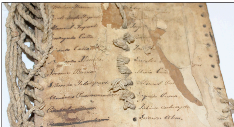
Figure 4: Section of the Ayacucho khipu board, Ministry of Culture, Ayacucho, Peru.

In Chile, the ethnohistorian Alberto Días Araya discovered a nineteenth-century khipu board that retains 109 cords in an array of colors—red, blue, yellow, brown, and cream (Días Araya, personal communication,