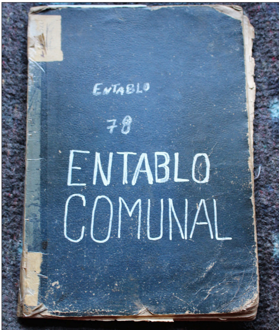
Figure 5: Cover of the Entablo.

In 2015, in response to the Hylands’ questions about the presence of khipu boards in the village, Casta authorities formally granted permission for them to study the manuscript, photograph it, and write about it. Bennison, whose doctoral fieldwork was carried out in the neighboring community of San Damián, conducted fieldwork in Casta in 2019. She also was allowed to read and photograph the manuscript, which