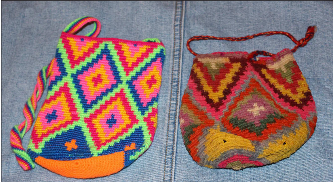
Figure 6: A recent wallki (left) and one from the 1970s (right) of goat hair collected by Sarah Bennison.

In this place, while the workers are in this peace and tranquility, they begin the padrón of the wallkis and of the hand-made gourds [for lime] ... that demonstrate the manual labor of each person ... consist[ing] of a small, well-wrought bag with threads of different colors and little gourds that are also well made ... and like ... the instrument the Chirisuya or oboe, everyone who knows how is obliged to play ... under the pain of being reprimanded and punished. (Entablo f. 5v) 12