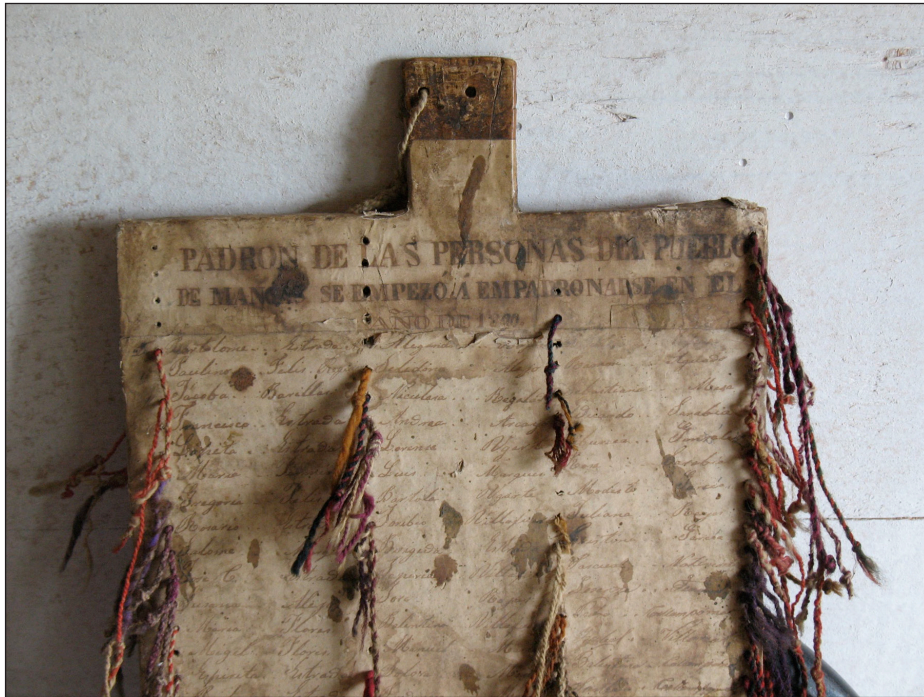
Figure 2: The khipu board of Mangas.