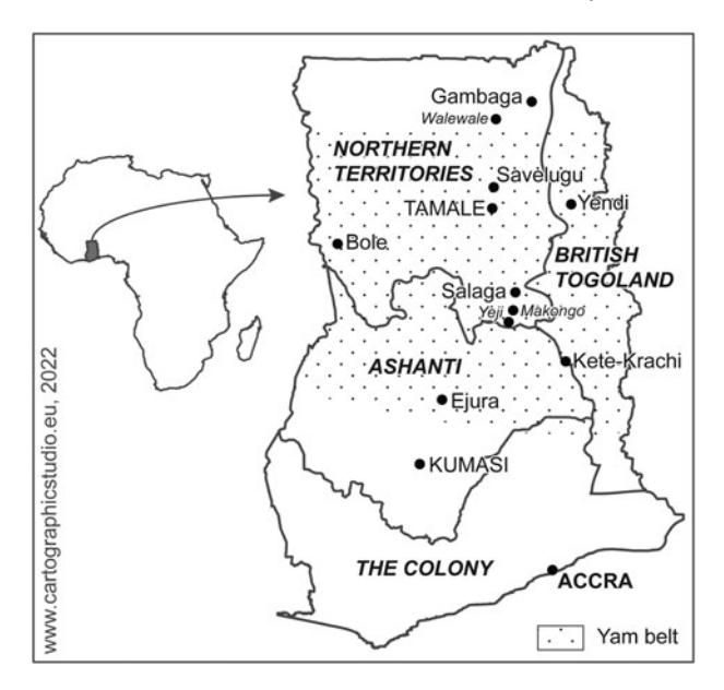
Figure 1. Map with the yam belt and the main sites cited in this text.

work six days each quarter (twenty-four days per year). Disobedience incurred fines or imprisonment, but chiefs were also liable to pay a fine if the road was not in good repair. ^{12}