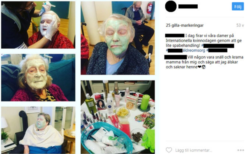
Figure 3. Residents getting spa treatments.

The man in the background of the top right photograph is worth noting. He is sitting in a wheelchair, apparently asleep or looking down at his hands, and not taking any interest in the activity. One must assume that the woman in the foreground was the photographer's subject, chosen to display an occasion of pleasure and luxury. The man's apparent idleness might bring to mind the passivity and boredom that were the characteristics of an institutionalised nursing home life. Thus, he presents a small crack in the carefully constructed glossy surface.