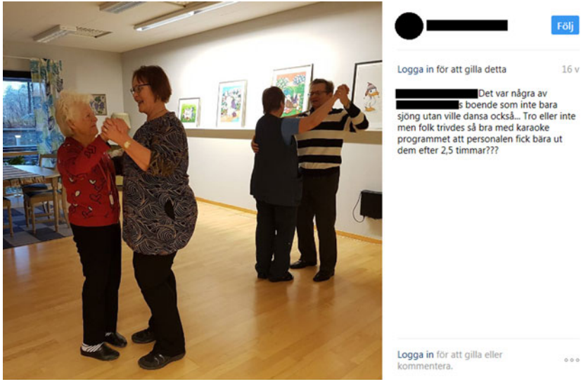
Figure 1. People having a good time dancing.

very opposite of what Goffman (1961: 17) claims characterises the total institution, namely a daily life structured by an enforced ‘sequence of activities being imposed from above by a system of explicit formal rulings and a body of officials’ – institutional hierarchal roles and asymmetrical relationships.