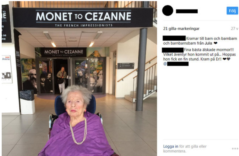
Figure 6. A trip to an art exhibition.

photographer (who presumably is a member of staff). One of them has a small dog on a leash. It is sunny and probably warm, judging from how the women are dressed. Beyond them is a breakwater, and behind it the sea and blue sky. The women seem unaware that a photograph is being taken, giving the impression that they are not posing for the camera, and that the way they are sitting, looking out at the sea, is ‘natural’. The caption reads: ‘Today we took a stroll down to enjoy the sea, eating delicious ice cream on the way.’ Although it is not possible to see the women’s expressions to gauge whether they were indeed enjoying both the weather and each other’s company, the caption is certain that they were, emphasising the delightfulness of the moment.