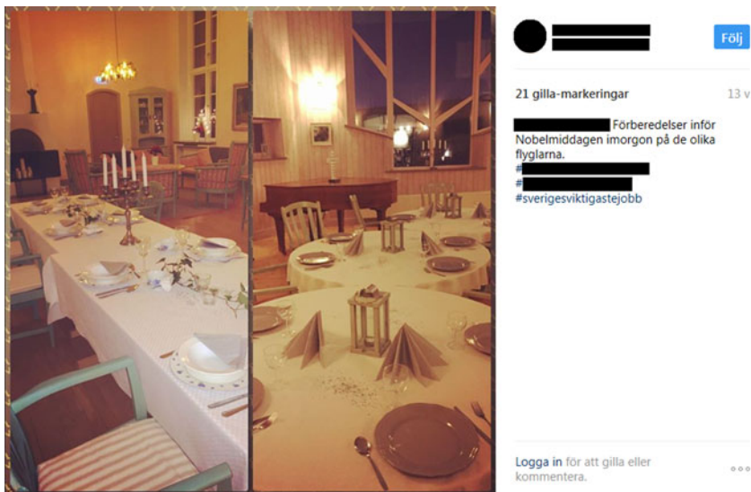
Figure 4. Preparations for a Nobel Day dinner.

joy of life is about'. Even though there are no terminally ill residents in the picture, it is clear that improving their care is the aim of the course, making this image the only one to touch on the subject of death and dying. The message is that this nursing home is always striving to improve, and that it is possible to ensure residents find 'joy of life' even when dying – although, perhaps unintentionally, the image is also a salutary reminder of the realities, contrary to the otherwise solid construct that nursing homes are not places of decline and death.