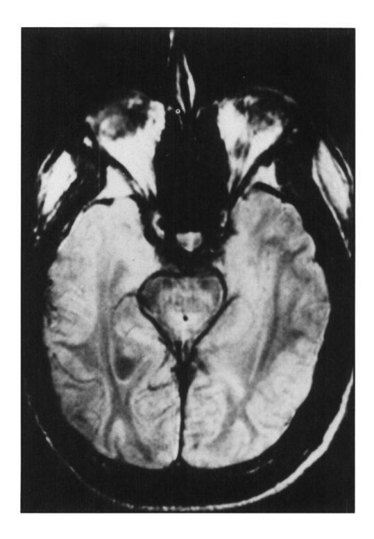
Figure 2 — Atrophy and increased signal from the temporal lobe (on left in figure) indicating mesial sclerosis.

In 26 patients there was sclerosis of the amygdala, with astrocytic gliosis and neuronal loss (Figures 2 and 3). This was of a mild degree in seven patients, moderate in thirteen patients and severe in six patients. Moreover, neuronal loss and gliosis were identified in the specimens of anterolateral temporal cortex