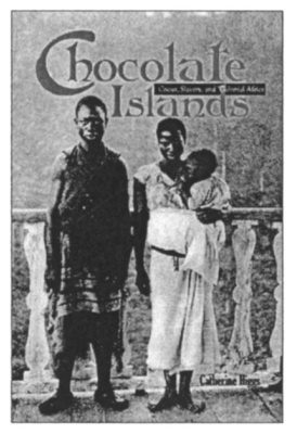
2012 · paperback: $26.95

Taifa is an account of how nation and race emerged out of the legal, social, and economic histories in one major city, Dar es Salaam, Nation and race were not simply universal ideas brought to Africa by European colonizers, as previous studies assume. They were instead categories crafted by local African thinkers to make sense of deep inequalities, particularly those between local Africans and Indian immigrants. Taifa shows how nation and race became the key political categories to guide colonial and postcolonial life in this African city.