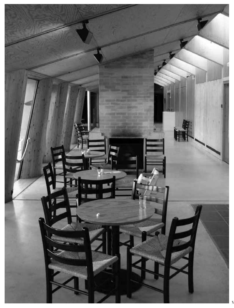
The hearth of the Kjell Aukrust Centre (1996): a timeless gathering place