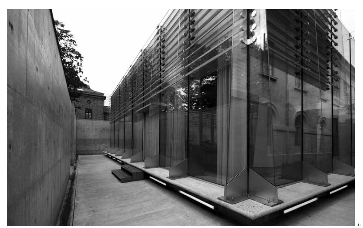
The limited visible world