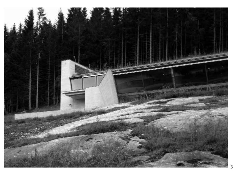
Building rooted to the ground: the Ivar Aasen Centre (2000)