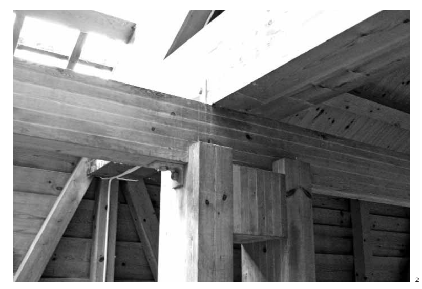
The structure brought to the light, Hedmark Cathedral Museum, Hamar (1979)