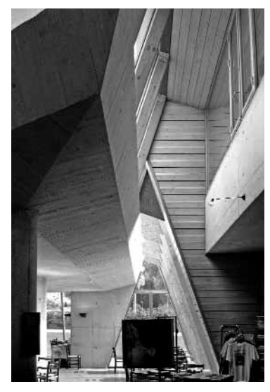
The mass is carved away by the light

to provide "a horizon for man", so that each project might identify a place in space between earth and sky'.¹ One of his favourite stories involved walking in the Norwegian landscape: