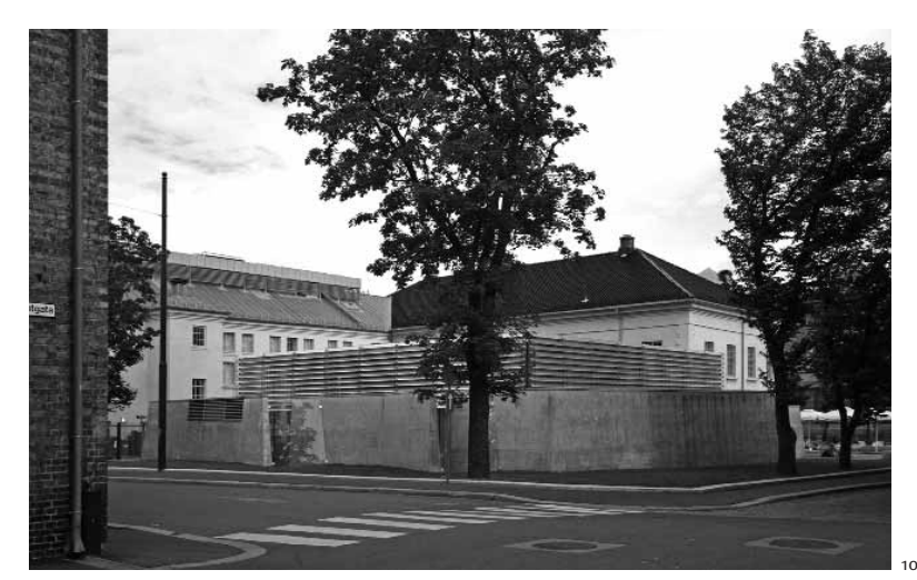
The artificial horizon, Museum of Architecture, Oslo