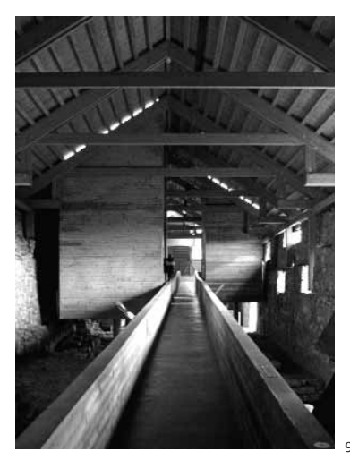
The museum is suspended over the past \,