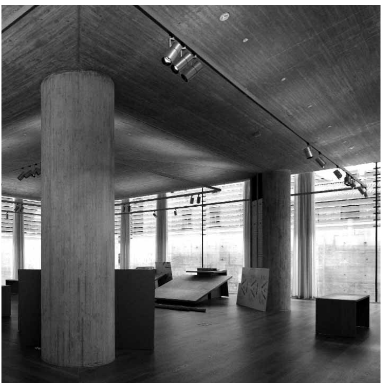
The concrete sky of the Oslo Pavilion

A recently completed building that continues this dialogue with place is Fehn's extension to the Museum of Architecture in Oslo [10]. He has created a new pavilion joined to C. H. Grolsch's Bank of Norway from 1830, which has been converted to an archive centre. While this is an urban site, and the walls of the pavilion are entirely glazed, a concrete wall placed two and a half