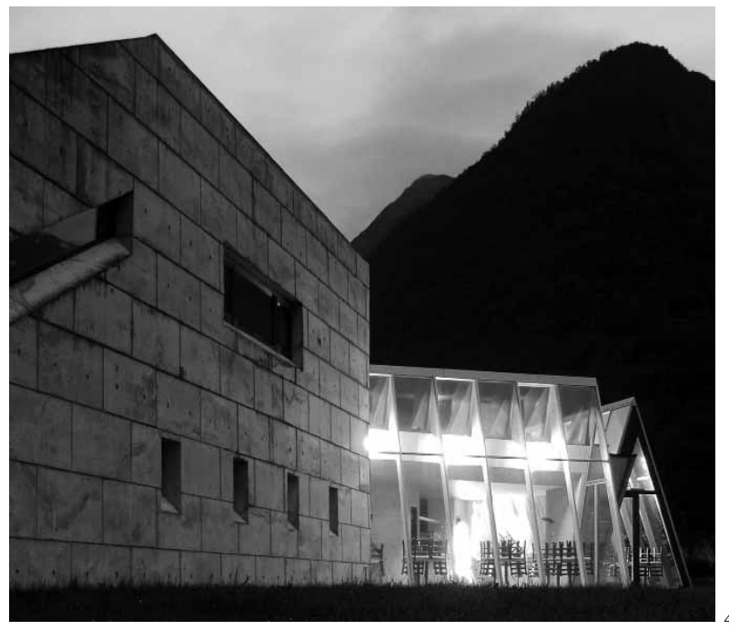
The construction as a microcosm of the site: the Glacier Museum, Fjærland (1991)