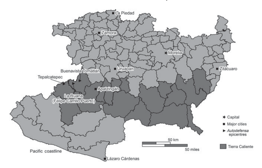
Figure 1. Michoacán, with Municipalities

despite the persistence of private property.<sup>54</sup> The region was further transformed by a cotton boom that displaced the cultivation of traditional food crops (maize, beans) and reoriented Tierra Caliente's political economy toward the export market.<sup>55</sup> This section examines the consequences of these development patterns, in particular the polarisation of the region's social structures that underlay its export-oriented political economy.