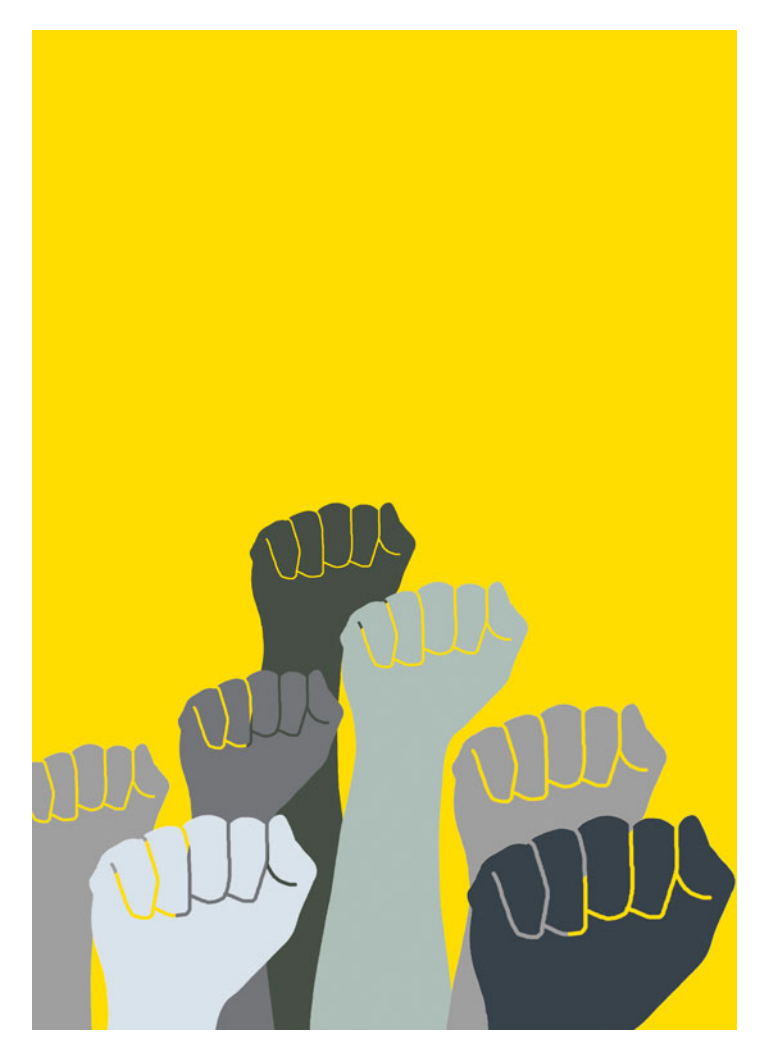
Fig. 1. Liberate our Degrees bookplate.

Goldsmiths is currently working on a number of key initiatives to address racial inequality including formulating a Racial Justice strategy, closing the degree awarding gap (currently BAME students gain fewer 'good' (1st class or 2:1) degrees than their white counterparts), mandatory all-staff Anti-Racism training, and a Racial Justice Audit examining the experiences of BAME professional and academic staff, and students. In 2018, one of London's newest art spaces, Goldsmiths Centre for Contemporary Art (CCA) was opened, hosting exhibitions by world-renowned artists.