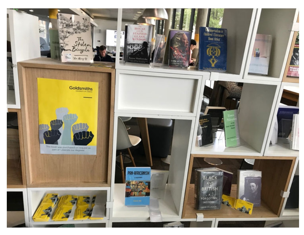
Fig. 2. Liberate our Degrees books display.

A dedicated Liberate our Library web page was set up with an opening mission statement, pronouncing the following: