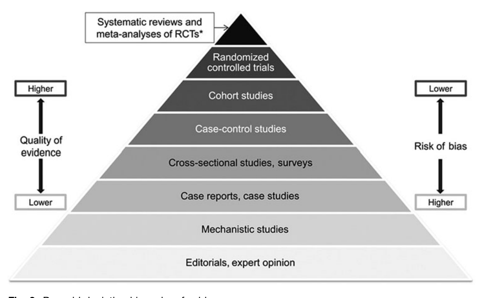
Fig. 2. Pyramid depicting hierarchy of evidence.