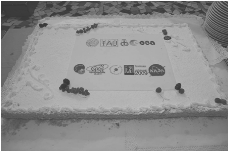
Figure 4. A view of the conference dinner held in Palazzo Zacco (Army's Officers Club), and the gorgeous cake.