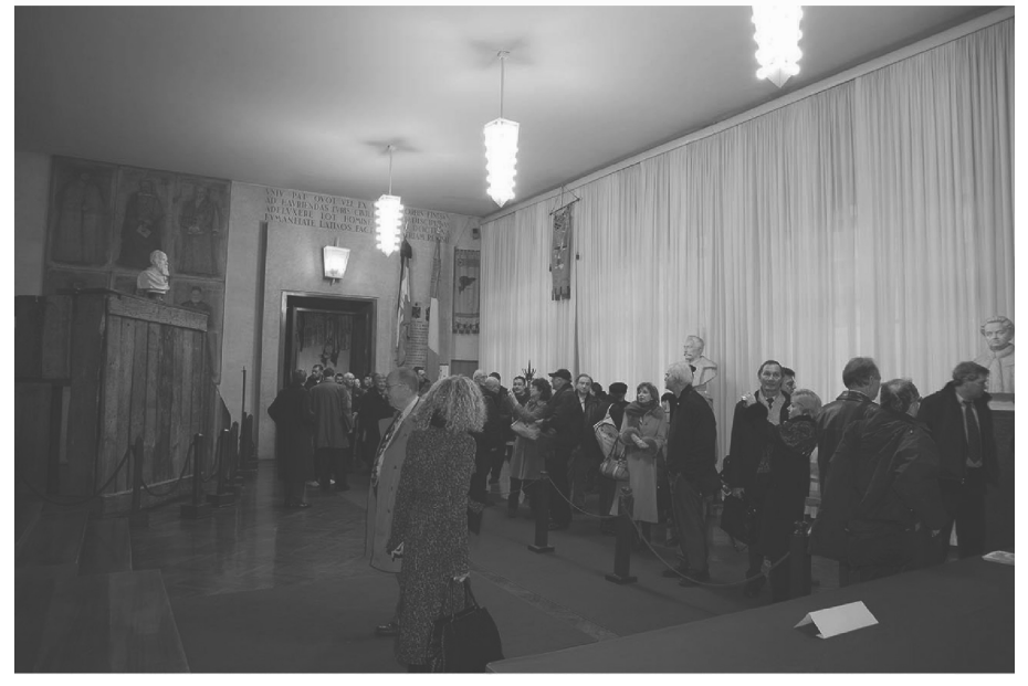
Figure 1. Registration under the severe eyes of Galileo from his chair.