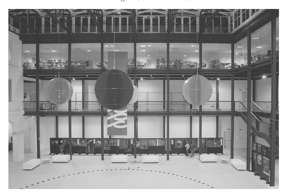
Figure 6. The beautiful images of the Medicean Moons prepared by P. Schenk, displayed in the Agorà of Palazzo San Gaetano.