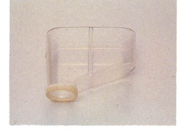
For example, our Noret<sup>®</sup> safety valve helps prevent splashback into the drip chamber and retards backflow if the unit is dropped or tipped.

Bel-Guard is a major advance in safety. Yet Bel-Guard is only one of the safeguards we've built into our new closed drainage system. Safeguards built in at the key entry points to keep bacteria out.