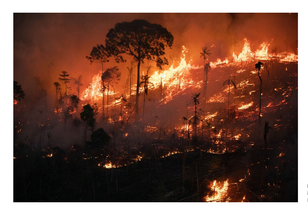
Figure 1. Record-breaking fires in August 2022 in Amazonia ( Amazônia Real , 1 September 2022). Image reused with permission from Lima (2022).

Supplementary material. The supplementary material for this article can be found at https://doi.org/10.1017/S0376892923000139.