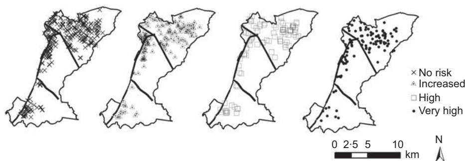
Fig. 1 Distribution of a population-based sample according to risk for metabolic complications, Campinas, São Paulo, Brazil, 2006–2007

All RMC categories compared with no risk.