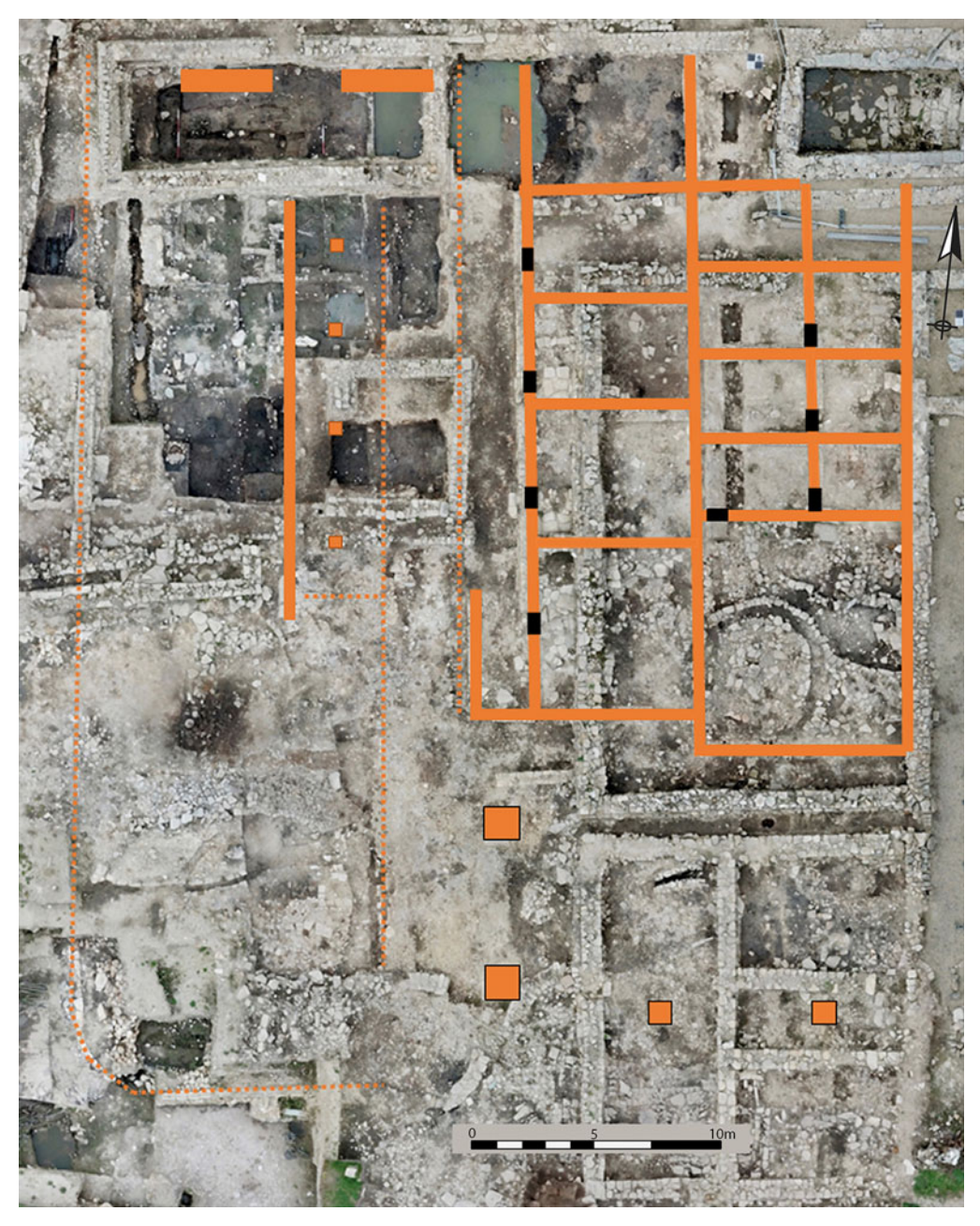
FIG. 8. Vindolanda. An annotated corrected image with the first stone fort buildings marked in orange.

located at the top of the western bank of the Ouseburn valley just to the south of Stepney Bank within the Ouseburn area of Newcastle, surprisingly some distance away from its assumed location that lay 300 m to the south-west of the site. The aim of the 2021 phase of works was