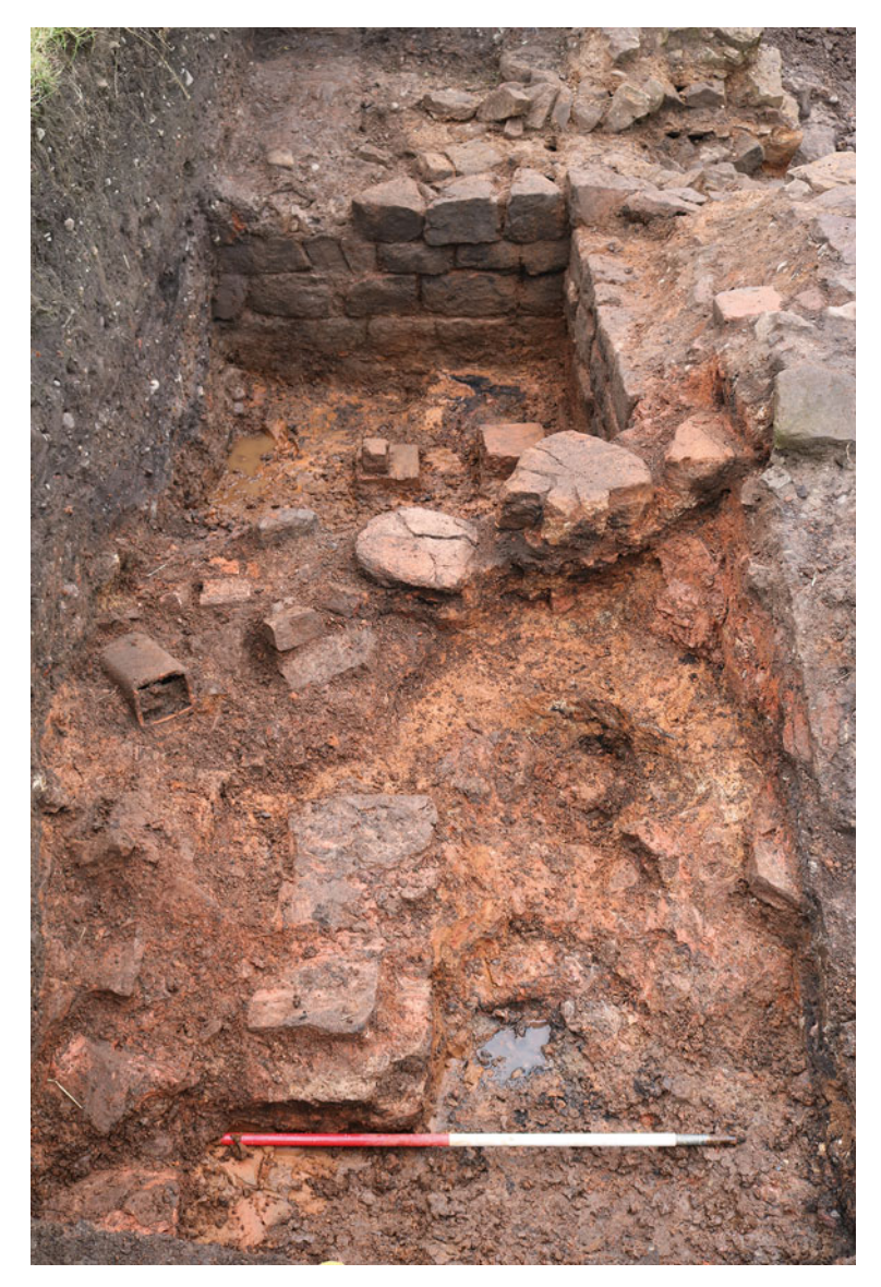
FIG. 4. Birdoswald. Heated room of stone building in Area A.

phallus on a block of sandstone with the inscription 'Secundinus Cacor'.<sup>42</sup> The remains of six more circular hut foundations were encountered to the immediate north of those excavated in 2000,<sup>43</sup> although most were poorly preserved and partial. Traditionally located in rows of five, back-to-back, with roads and drains between them, an unusual addition of a single and isolated circular hut of an otherwise unique design was also discovered below the walls of third- and