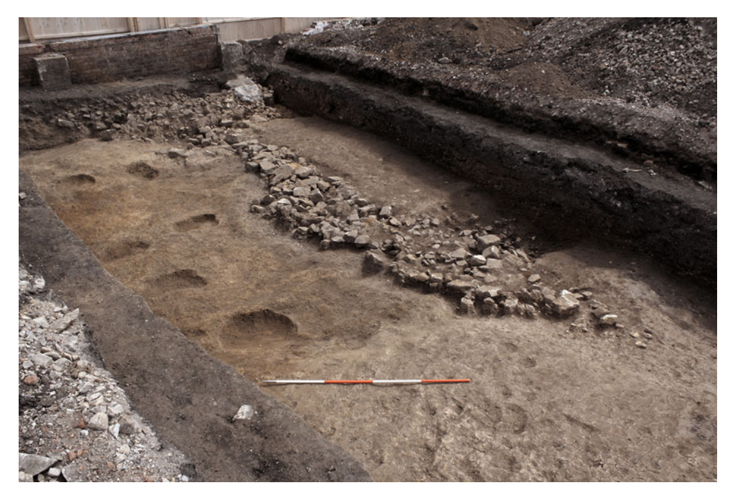
FIG. 9. Turret 3a showing berm obstacle pits to the north.

only to expose the remains of Hadrian's Wall with excavation limited to any berm obstacle pits and the northern ditch. Any remains relating to Hadrian's Wall itself were to remain in situ with the development designed to avoid these archaeologically sensitive areas.