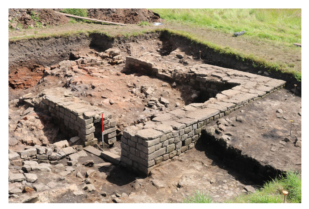
FIG. 3. Birdoswald. Area A stone building the heated room can be seen at the far left of the image.

the area confirmed that it survived to a height of 2 m. At the eastern end of the building a subdivided room contained a hypocaust based on ceramic tile pilae, and a complete box-flue tile was recovered. The water-main from the north was traced in the direction of this hypocaust, which showed signs of extreme burning (FIG. 4). It is possible that this pipeline supplied a water boiler, and that this structure was part of a fort bath-house complex.