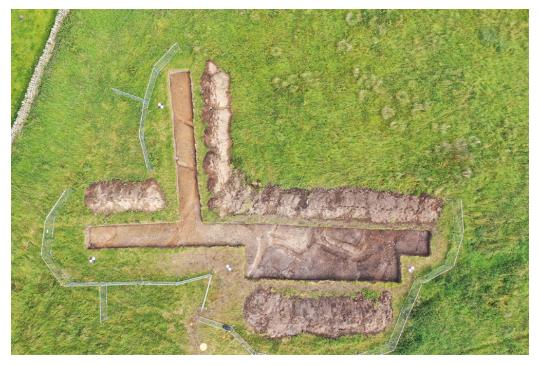
FIG. 6. Birdoswald. Area D, north of the fort and Hadrian's Wall showing clay-sill foundations for timber buildings.

impacted the ability of the archaeological team to penetrate the underlying anaerobic layers of the site as the hot dry weather had a detrimental effect on the preservation of the waterlogged deposits. However, once the weather broke the northern half of the excavation established the presence of wattle-and-daub fences belonging to a succession of six timber layers of occupation, dating from the late first to mid-second century. Eleven writing tablets, 40 shoes and boots and several other well-preserved items were recovered which included branded barrel staves, tools and many arrow and lance heads. In 2023 the final season in this part of the site will complete the excavation of this quadrant and will conclude with the installation of ground monitoring equipment to continue to monitor the impact of climate change on the sensitive buried remains.