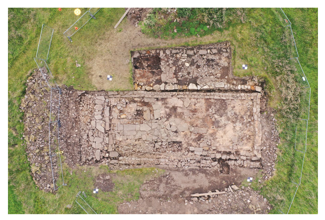
FIG. 5. Birdoswald. Strip buildings fully excavated in Area B.

fourth-century barrack adjacent to the via decumana (FIG. 7). Unlike its counterparts, this structure provided no evidence of having had a stone wall foundation and was bordered by a circular cut filled with turf and soil, possibly the foundation for a wattle and daub wall. This fill was secured by a one-course, non-facing stone line of medium-size rubble stones 40 cm diameter. Like its more traditional counterparts, this building had an internal diameter of c. 4.50 m and an external diameter of c. 5 m, with a floor composed of crushed sandstone and pebbles. Two stone-lined access paths, one facing east to the via decumana and the other facing north, were also associated with this hut, as was a stone-lined waste pit constructed from the same rubble material as the outer foundation of the hut. The area surrounding the circular hut, including the waste pit, produced a quantity of material culture previously unattested from Severan hut contexts at Vindolanda. Artefacts included several carved bone tools, a twisted copper-alloy bracelet, a quern stone, two knife blades, a scabbard chape and a copper-alloy decorative hinge in the shape of a duck (SF 23350). The purpose of this building remains uncertain, but the lack of a domestic hearth may suggest that it may not have been used as a dwelling, and instead served another purpose for the Severan circular hut community.