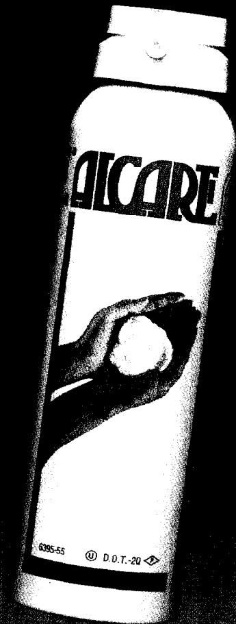
Aicare® Foamed Alcohol