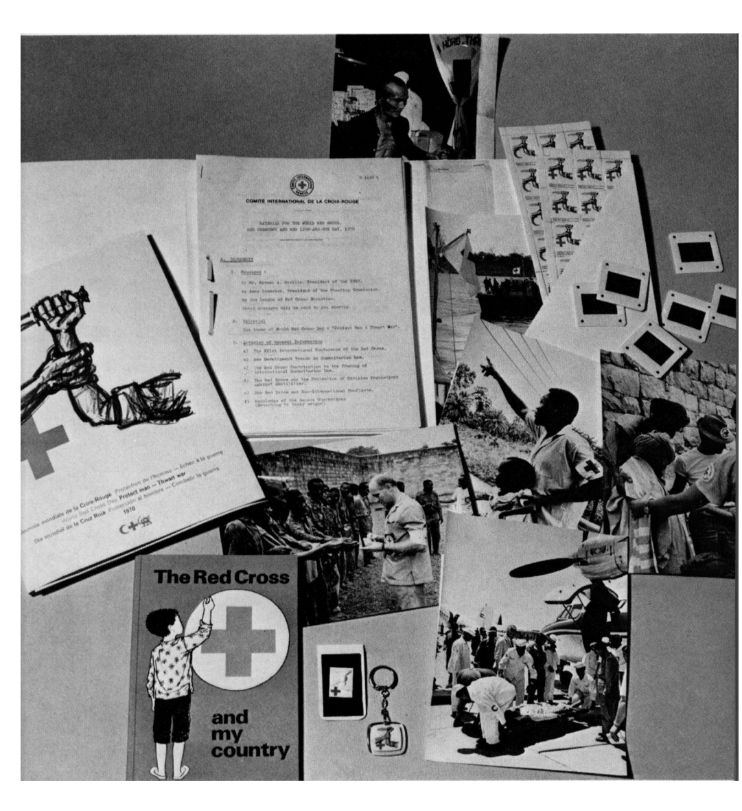
Material available to National Red Cross, Red Crescent, and Red Lion and Sun Societies.