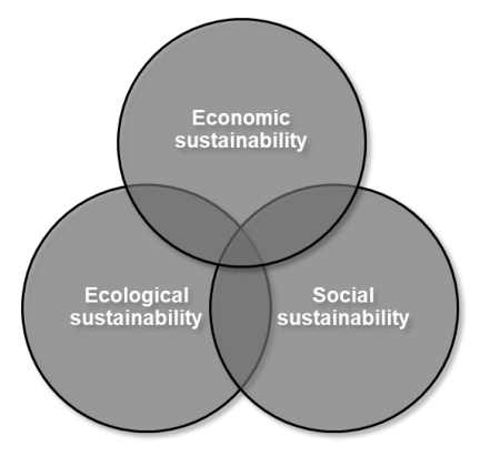
Figure 1. Three dimensions of sustainability based on (Becker et al., 2015; Scholz et al., 2018)