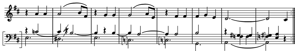
b Kinderman's transcription